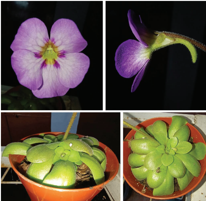
Figure 1: Pinguicula 'Psychedelic Purple' flower and plant.