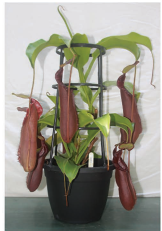
Plant not included

Ferocious Foliage P.O. Box 458 Dahlonega, GA 30533