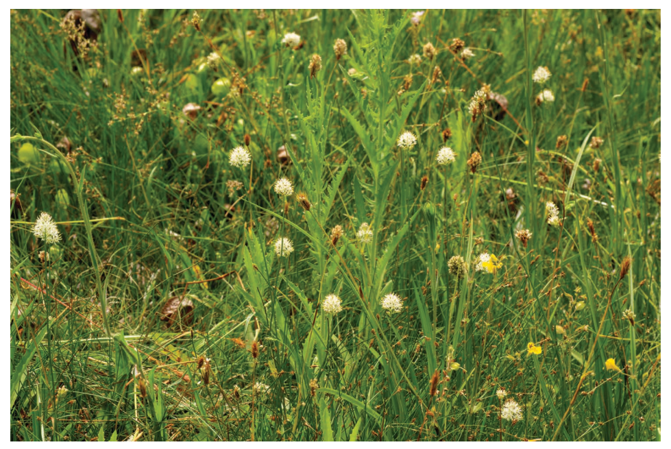
Figure 4: Tall flowering Triantha occidentalis subsp. occidentalis in Nevada County, California, on the western slopes of the Sierra Nevada. The large dried infructescences belong to Bistorta bistortoides .

bits of detritus stuck to them (seeds, dirt, etc.), none of them were observed to have what could be clearly identified as captured insects.