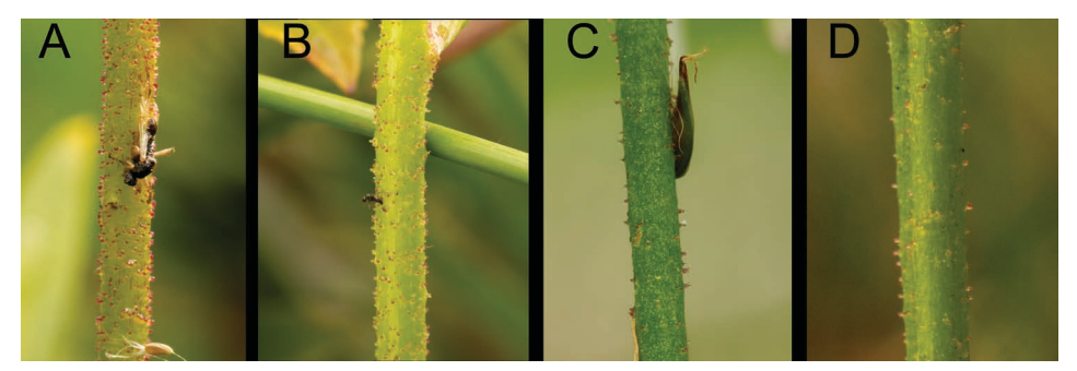
Figure 1: Inflorescence glands just below the lowest flower or fruit. A) Triantha occidentalis subsp. brevistyla , Whatcom County, Washington; B) Triantha occidentalis subsp. occidentalis , Marin County, California; C) Triantha occidentalis subsp. occidentalis , western slope Nevada County, California; D) Triantha occidentalis subsp. occidentalis , eastern slope Nevada County, California.

The first site was in Marin County, at Point Reyes National Seashore, at one of the disjunct coastal sites. The plants occur in a heavily grazed area, where freshwater seeps through the