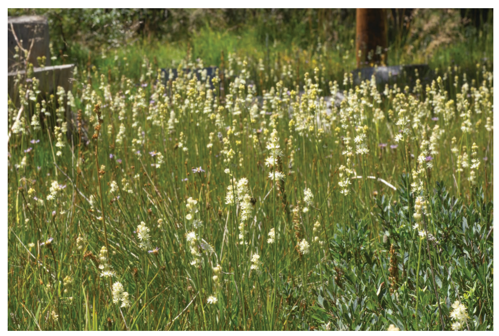
Figure 5: A dense population of Triantha occidentalis subsp. occidentalis in Nevada County, California, on the eastern slopes of the Sierra Nevada.