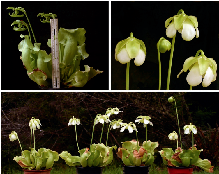
Figure 2: Sarracenia purpurea f. luteola ‘Super-duper’ plant and flower.

—BOB ZIEMER • McKinleyville • California • USA • bob@carnivorousplants.org