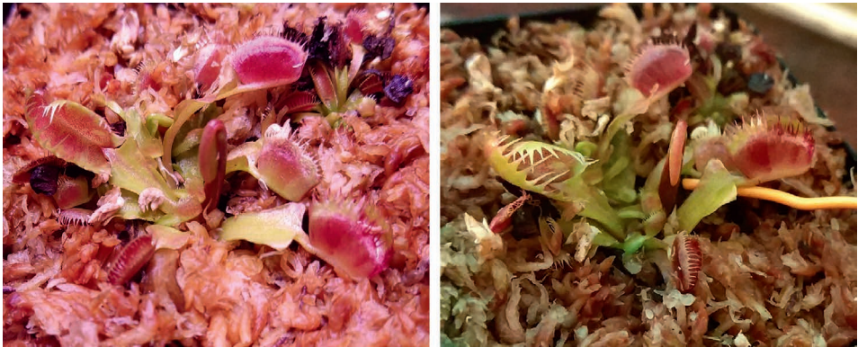
Figure 4: Dionaea 'Stove Fire'.

—DING WEIJIE • Tai'an Town • Guangling District • Yangzhou City • Jiangsu Province • China • 2034207165@qq.com