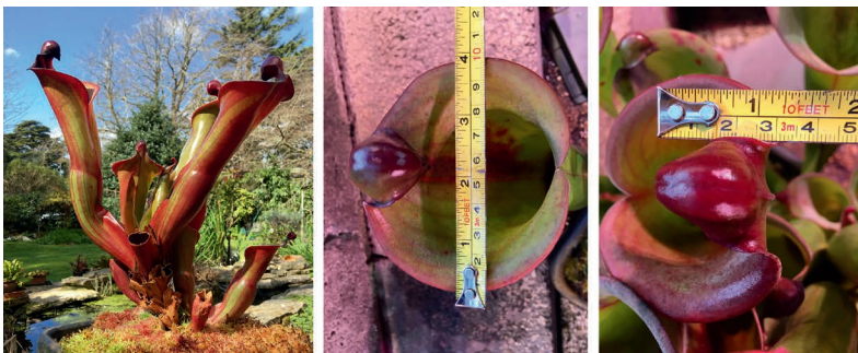
Figure 3: Heliamphora ‘Cyclops’.

—ANDY SMITH • Bournemouth • Dorset • England • nepenthescarnivorous@yahoo.co.uk