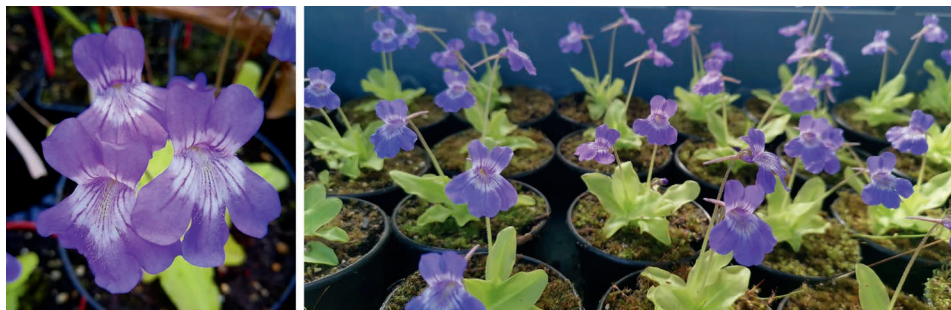
Figure 1: Pinguicula 'Eye Spy'.

—STEVE BUNCLARK • Predator Plants • Rackheath • Norwich • Norfolk • Great Britain • predatorplants4u@yahoo.com