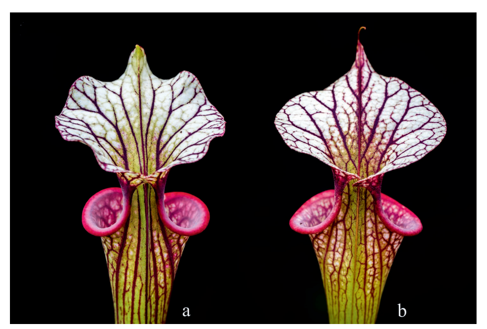
Figure 4: Comparison of venation pattern and lid shape of a) Sarracenia 'Inspiration' and b) Sarracenia 'Adrian Slack'.

Sarracenia 'Inspiration' does not require any specific growth conditions compared to other Sarracenia. Very sunny and hot conditions are required to obtain optimal coloration. To keep its original genotype, propagation must be by vegetative means only. Sarracenia 'Inspiration' is unfortunately not a very strong growing plant. Despite this, it is already well spread across European collections under its hybrid label or code mentioned above. A few specimens are also in circulation among U.S. growers.