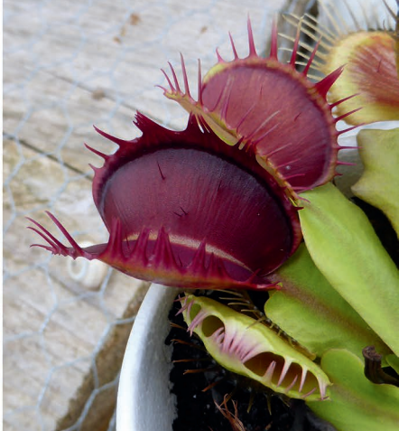
Figure 2: Dionaea 'Cleopatra' plant and traps.