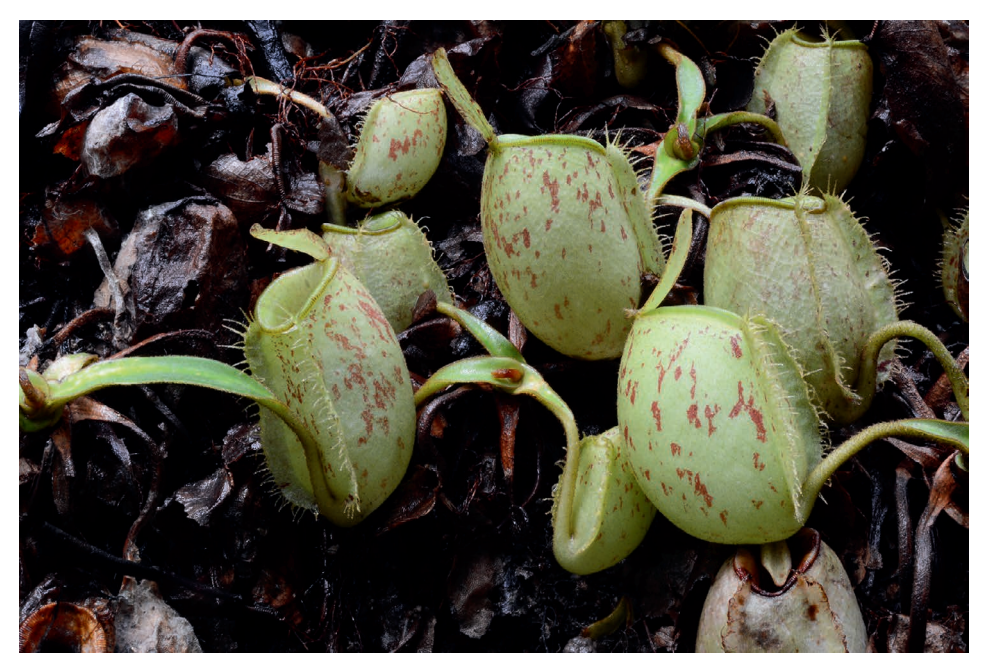
Figure 2: Nepenthes ampullaria growing at Kent Ridge, Singapore. Jack first discovered this species in Singapore in 1819.