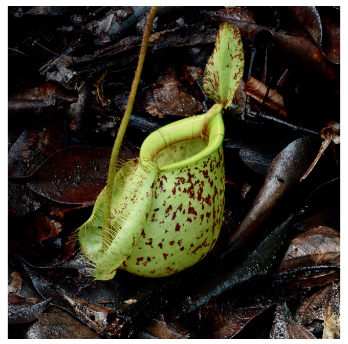
Figure 5: A natural hybrid between Nepenthes ampullaria and N. rafflesiana , N \times hookeriana growing at Kent Ridge, Singapore.

Clarke (2001) suggests that Nepenthes ampullaria has developed strategies for obtaining sources of nitrogen other than from insects. This species is unusual in that it has evolved growing in shade beneath the forest canopy, where it receives a constant stream of debris, including twigs, dead leaves and flowers, and scat from above. Moran et al. (2003) estimate that N. ampullaria plants growing under the forest canopy derive 35.7% ( \pm 0.1\% ) of their foliar nitrogen from leaf litter. The author has observed this first hand at Kent Ridge in Singapore and Gunung Murud National Park, where populations of N. ampullaria are covered by a layer of detritus from the canopy above, often with just the pitcher mouth visible.