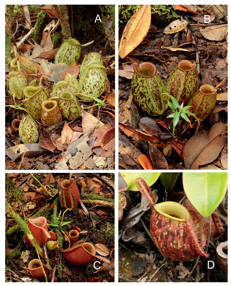
Figure 3: (A) A typical dense cluster of lower pitchers of Nepenthes ampullaria . (B) Colorful lower pitchers growing amongst leaf litter and other canopy debris. (C) An all red form. (D) Occasionally tri-color forms exist. Plants in photos A, B, C are growing in Gunung Mulu National Park, Borneo; photo D plant is growing at Kutching, Borneo.

the fringe elements 0.5-1 cm long, 0.2 mm apart; mouth oval, almost horizontal, straight; peristome flattened, to 1.5 cm wide, and sloping steeply inwards; lid narrowly oblanceolate, to 4 by 1.5 cm, apex rounded, base cuneate, lower surface lacking appendages, nectar glands extremely sparse,