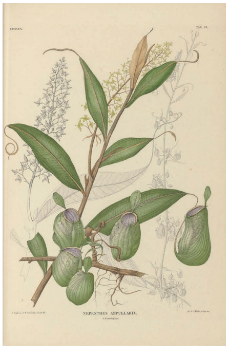
Figure 1: An early botanical illustration of Nepenthes ampullaria . This illustration was included in Korthals' 1839 monograph of the genus Nepenthes .

"I came across N. ampullaria among the massive vegetations [ sic ] of a swamp-forest on the island of Siburut [ sic ] off the west coast of Sumatra. It was a fabulous, unforgettable sight. Everywhere, through the network of lianas the peculiarly formed pitchers of this species gleamed forth, often in tight clusters; and, most remarkably, the muddy, moss overgrown soil was spotted with the pitchers of this plant, so that one got the impression of a carpet."