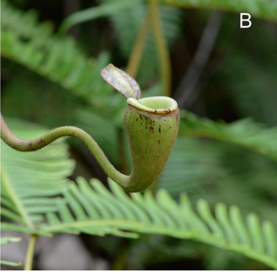
Figure 4: (A) Nepenthes ampullaria occurs at higher elevations in New Guinea. These lower pitchers are growing at 530 m asl on Mt. Angemuk. (B) A rare upper pitcher photographed at Sibolga, Sumatra.

usually 6-12, sometimes absent, orbicular, broadly bordered, 0.4-0.5 mm diam., central pore c. 0.1 mm diam.; spur simple or branched, up to c. 10 mm long. Upper Pitchers generally not developed, rudimentary, broadly infundibuliform, c 2 by 2 cm. Male inflorescence a panicle to 40 by 4-5 cm; peduncle 2.5 cm long, 3 mm diam. At base; partial peduncle 8-12(-50) cm long, fasciculate at apex, (1-)3-6(-10)-flowered; bracts foliose, spathulate, 12-14 by 4-5 mm, inserted 0-2 mm from base of partial peduncles; pedicels 7-8 mm long; tepals broadly elliptic, 4-5 by 3-5 mm, androphore 3-5 mm long; anther head 2 by 1.5 mm. Indumentum densely velvety in young parts, under leaf blades, especially margins, on young pitchers and on the inflorescence; hairs red or brown, mostly simple, 0.3 mm long. Colour of pitchers usually green, deeply flecked with maroon, rarely entirely red, sometimes almost whitish yellow, with pale pink flecks, likewise the leaves of these pitchers may be a pale yellow-pink if buried beneath leaf litter; tepals green to yellow; indumentum deep red.