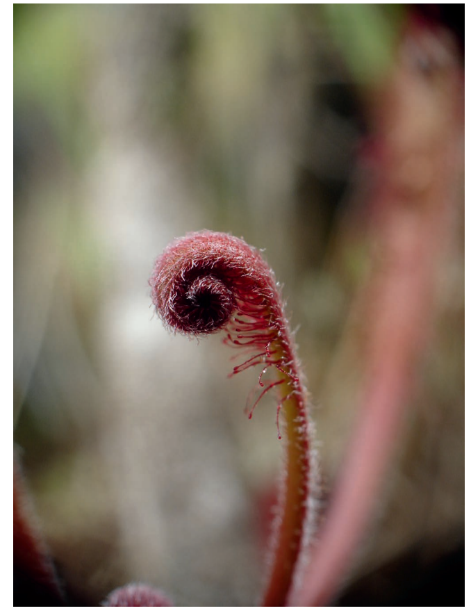
Figure 2: Circinate leaf vernation of Drosera villosa : the leaf in bud of most members of D. sect. Brasiliae is enrolled like a mainspring or crozier – which distinguishes this affinity from other Neotropical Drosera.

Drosera section Ptycnostigma Planchon, Ann. Sci. Nat., Bot., sér. 3(9): 92-93 (1848).