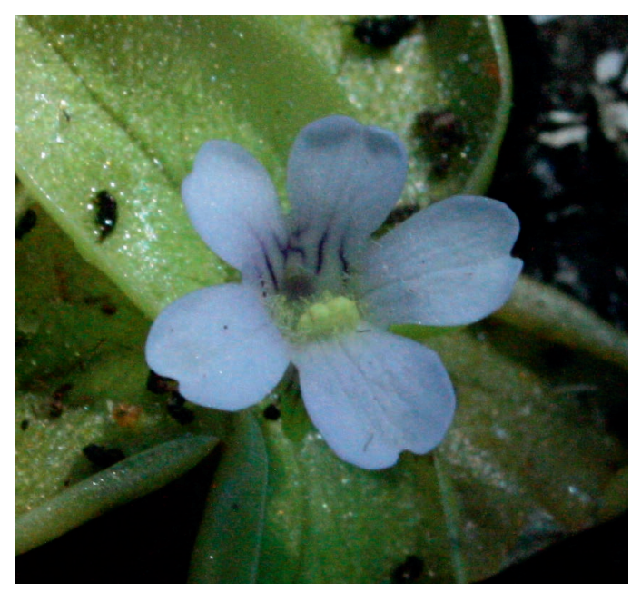
Figure 4: Pinguicula nahuelbutensis . Front view of a flower. The yellow 2-parted palate is located at the base of the middle lobe of the lower lip. (photo from location "las turberas" in the Nahuelbuta National Park, 26 January 2010).