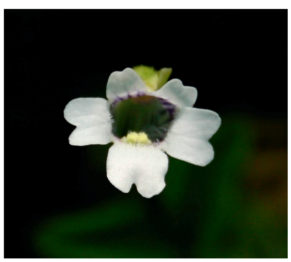
Figure 2: Pinguicula antarctica . Front view of a flower. The yellow 2-parted palate is located at the base of the middle lobe of the lower lip and the corolla is bilabiate with white colored petals (photo from a cultivated specimen originating from Isla Grande de Chiloé, Chile).

Curacautín, Sierra Nevada, ca. 1670 m (personal observations); región de los Ríos, Osorno, paso Puyehue; Argentina: provincia de Río Negro, Parque Nacional Nahuel Huapi, Cerro Nireco; provincia de Río Negro, Parque Nacional Nahuel Huapi, Cerro de la Nubes; provincia de Neuquén, paso de Pino Hachado; provincia de Neuquén, Cerro Campane; provincia de Neuquén, Arroyo los Guemados; provincia de Neuquén, Copahué (see Fig. 3).