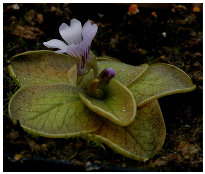
Figure 5: Pinguicula nahuelbutensis . Plant with pale violet flower and flower bud (in cultivation). The flower shows a dark violet venation on the outside of the corolla, tube and spur.