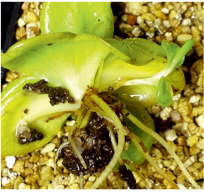
Figure 7: Pinguicula nahuelbutensis . Stolon with plantlet developing at the base of the leaf rosette (in cultivation).