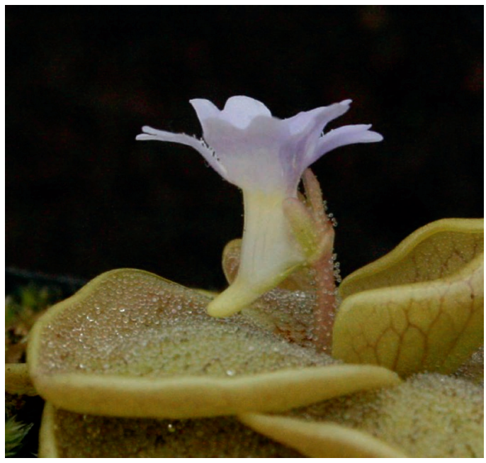
Figure 6: Pinguicula nahuelbutensis . Lateral view of a flower with pale violet corolla lobes and a white to light yellowish tube (in cultivation). The flower shows almost no venation on the corolla or tube. The lobes of the calyx are divided almost to the base.