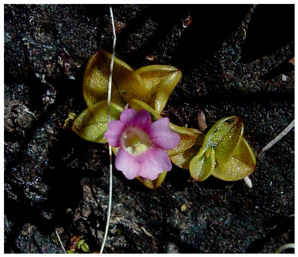
Figure 1: Pinguicula australandina . Plant in flower growing in volcanic debris at the edge of a typical alpine wet pasture in the Sierra Nevada, region Araucanía, Chile, at about 1670 m a.s.l. Note the almost isolobiate pink corolla with the yellow 2-parted palate located in the tube below the middle lobe of the lower lip.

wide, and covered with short, yellow subclavate hairs. Behind the palate are 3 rows of long, white, cylindrical hairs. The walls of the corolla tube are also clothed in long, white hairs. The conical spur is 2-3 mm long, obtuse or slightly pointed at the tip, light green and sometimes brownish-green towards the tube, and sparsely covered with short, stipitate glandular hairs. The seed capsule is ovoid.