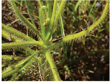
Figure 3: Three individuals of day-flying Tiger Moth (Arctiidae – Ctenuchinae, probably Amata sp.; left: 2 males, right: female) sticking to D. finlaysoniana at Keep River NP.

A few of them could be tentatively identified from the photographs (Fig. 2). Very common prey was the Tawny Coster ( Acraea terpsicore ; Lepidoptera: Nymphalidae), an invasive butterfly species from India which spreads widely in Northern Australia; frequently, three or more individuals of that species (mainly males, but also females) were caught by a single plant of D. finlaysoniana (Fig. 2).