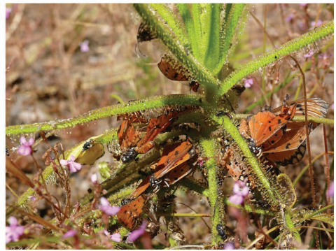
Figure 2: A single individual of strongly honey-perfumed D. finlaysoniana covered with prey. Besides Diptera (various small flies, midges and mosquitoes), Hymenoptera (small solitary wasps) and Thysanoptera (thrips), prey mainly consisted of Lepidoptera: 1. Geometridae (a species of geometer moth), 2. Pterophoridae (species of plume moth), 3. day-flying Tiger Moth (probably Amata sp.; Arctiidae), 4. Grass Yellow ( Eurema sp., Pieridae), and 5. Eight individuals of Acraea terpsicore (Nymphalidae). The accompanying pink-flowered plant at the bottom is the glandular, annual Styloidium adenophorum .

On a single large plant I counted an astonishing total of 35 butterflies and moths adhering to the numerous gland-covered, thread-like leaves of the plant. Most impressive was not only the large number of butterflies caught by the plant, but the many different species (both males and females) of Lepidoptera from different families which were found attracted to and killed by D. finlaysoniana .