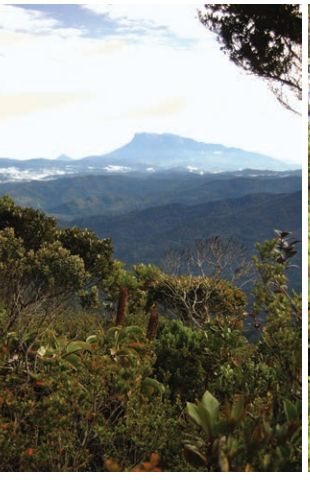
Figure 8: Mount Kinabalu seen at the north horizon from the ridge top summit trail.