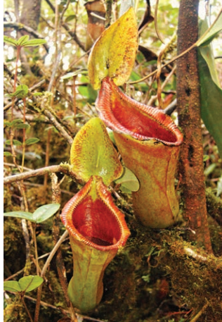
Figure 4: Nepenthes Iowii.