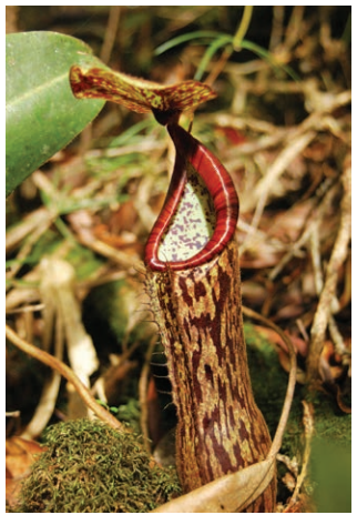
Figure 2: Nepenthes stenophylla.