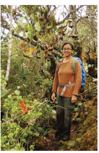
Figure 9: Author with a bunch of N. lowii hanging above.

We dawdled through the beautiful natural surroundings. Our laggard group arrived at the Gibon cabin at 4:30 pm. We spent a cold and damp rainy night, with a temperature of about 14°C and 99% humidity in the cabin, which could fit 18 people. We planned to wake up as early as 4 am to catch the sunrise at the summit. Unfortunately, when we awoke, it was still drizzling. We then began another 1.5 km journey to the peak at about 6 am.