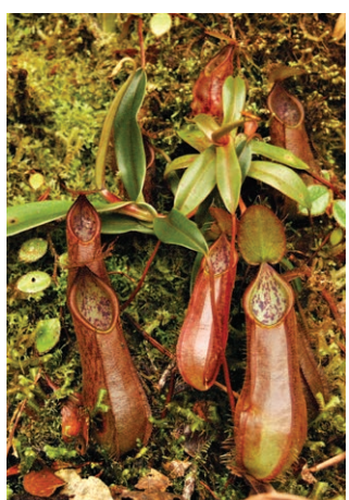
Figure 1: Nepenthes tentaculata.

A clump of Nepenthes stenophylla (Fig. 2) was found growing terrestrially at 1700 m a.s.l. It only had two pitchers with the biggest one measuring about 20 cm in length. The cylindrical pitchers with beautiful dark purple streaks have a round lid and rounded boss at the base of the lid, which are the distinctive features of this species. That is the only clump I found along the summit trail. Over