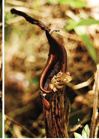
Figure 3: A small montane bush frog perched on the rim of Nepenthes fusca .