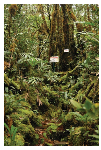
Figure 7: The trail in the mossy forest.