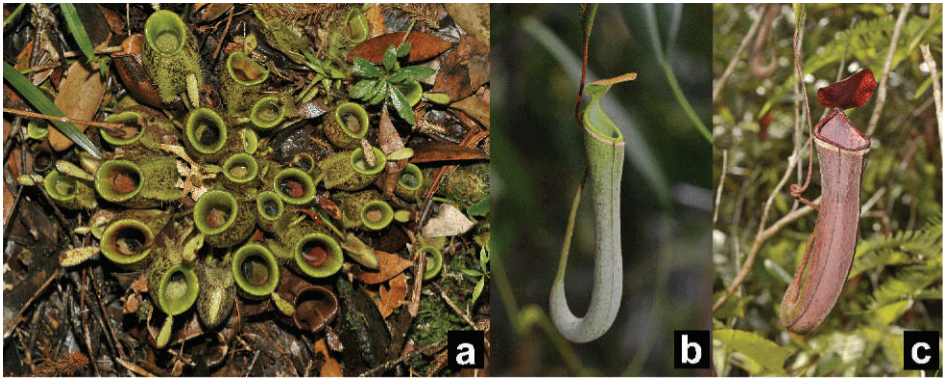
Figure 2a: Nepenthes ampullaria Jack showing detritus in pitchers (photo: Rogier van Vugt, Malaysia, Gunung Jerai); b: N. albomarginata T.Lobb ex Lindl., green form (photo: Rogier van Vugt, Hortus botanicus University of Leiden, originally from Malaysia, Sarawak, Bako National Park); c: N. albomarginata T.Lobb ex Lindl., purple form from Malaysia (photo: Rogier van Vugt, Malaysia, Bukit Bendera).

mouth of the pitcher needed to be held horizontally (normally the mouth is somewhat diagonal; Fig. 1a & b). The content was then collected in a cylinder with a scale. Depending on the size of the pitchers, cylinders of 10, 50, 100, and 250 ml were used. The height of the pitchers was measured with a ruler from the base of the cup (where the tendril ends and the actual pitcher begins) to where the lid is attached to the pitcher (highest point of the diagonal mouth; Fig. 1c). The ruler must be held parallel to the pitcher in such a way that the ruler is in line with the two measuring points.