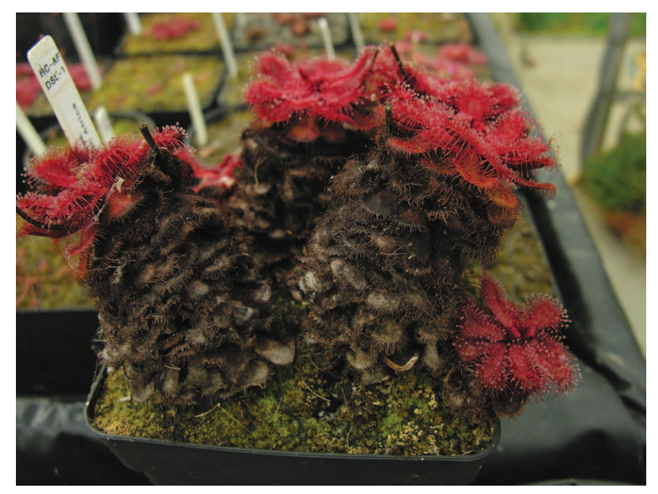
Figure 2: Old pedestal forming rosettes.

growing season, with the result that the plants have thrived, with none of the reduction in rosette size previously seen. In the wild of course, the natural rainfall will have the same effect.