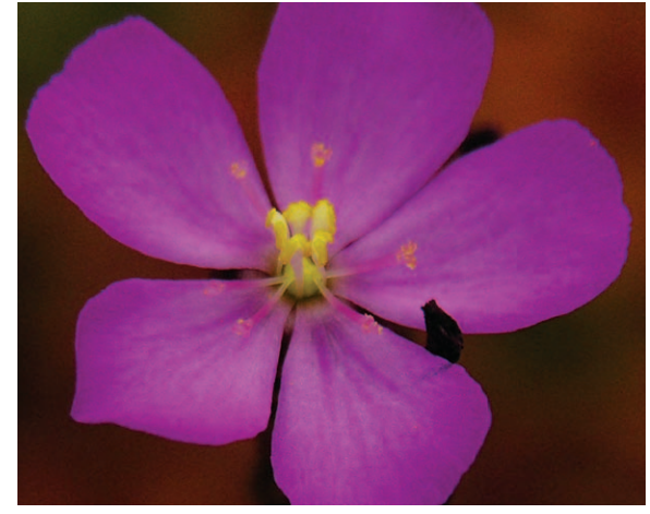
Figure 3: Glandular scape (left) and closeup of flower (right).