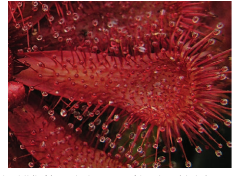
Figure 1: Deep crimson rosettes of Drosera slackii (left) and closeup of lamina (right).