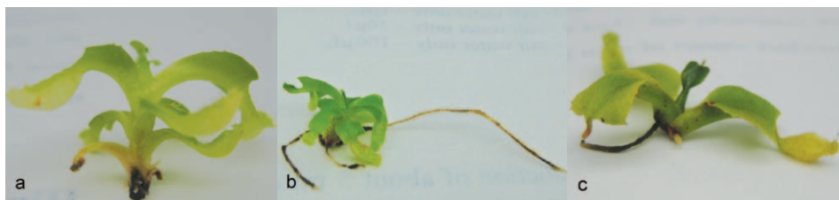
Figure 2: Nepenthes truncata plantlets placed in agar (a), vermiculite (b), and Silvosa medium (c) for 4 months.

Root and shoot parameters were not significantly different between plantlets from different cutting locations (tip and base) supplemented with different IBA concentrations (Table 3). The root and shoot parameters were not significantly affected by the application of 3 different IBA concentrations. Loca-