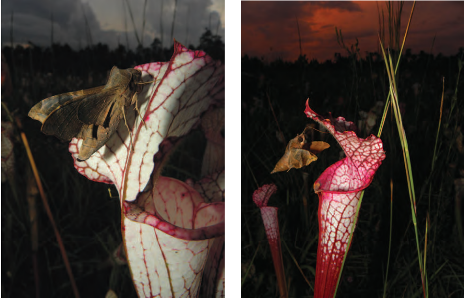
Figure 1: Humming bird moths feeding on Sarracenia leucophylla at the Splinter Hill Bog Preserve near Rabun, Alabama after sunset.

I love the way these plants have evolved and how over the millennia they have created a microcosm of tiny creatures interacting within a complex ecology. It has been my pleasure to share this tiny portion of that world with you.