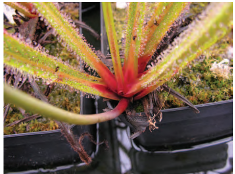
Figure 2: Red leaf bases of Drosera regia .