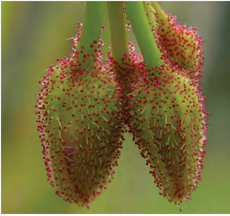
Figure 5: Glandular Drosera regia calyx lobes.