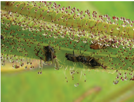
Figure 1: Close up of Drosera regia leaves.

The large amount of mucilage produced by the tentacles mean that this species catches many more insects than others, and its leaves can become black with insect carcasses.