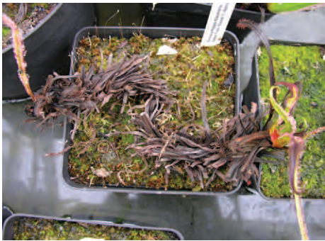
Figure 4: Drosera regia plants emerging from dormancy.

lose their growth, producing a kind of loose hibernacula of tiny truncated leaves sometimes barely 1 cm in length (see Fig. 4). At this time they are fairly tolerant of low temperatures, enduring the occasional freeze. With the increase in day length, growth resumes in early March, and within one month they can produce a rosette of 4 or 5 mature leaves which unfurl watch-spring-like until they are fully open.