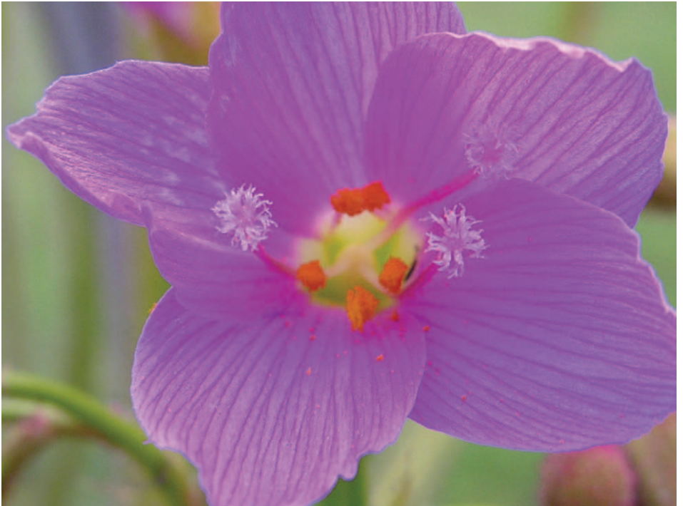
Figure 7: Receptive, fimbriate stigmas, clearly visible.

stalked red glandular hairs—protection from sap sucking insects (see Fig. 5). The flower scapes are usually taller than the leaves and can branch several times, so a single stem may support as many as 20 flowers. The flowers themselves are spectacular, up to 3 cm in diameter, bright pink with darker pink veins running the length of each petal, with the green glandular calyx lobes holding their bases together so that a tube is formed, from which emerge the anthers and