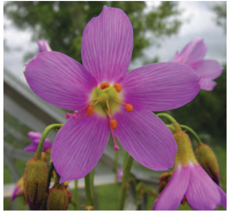
Figure 6: The stigmas are simple and un-receptive.

stalked red glandular hairs—protection from sap sucking insects (see Fig. 5). The flower scapes are usually taller than the leaves and can branch several times, so a single stem may support as many as 20 flowers. The flowers themselves are spectacular, up to 3 cm in diameter, bright pink with darker pink veins running the length of each petal, with the green glandular calyx lobes holding their bases together so that a tube is formed, from which emerge the anthers and