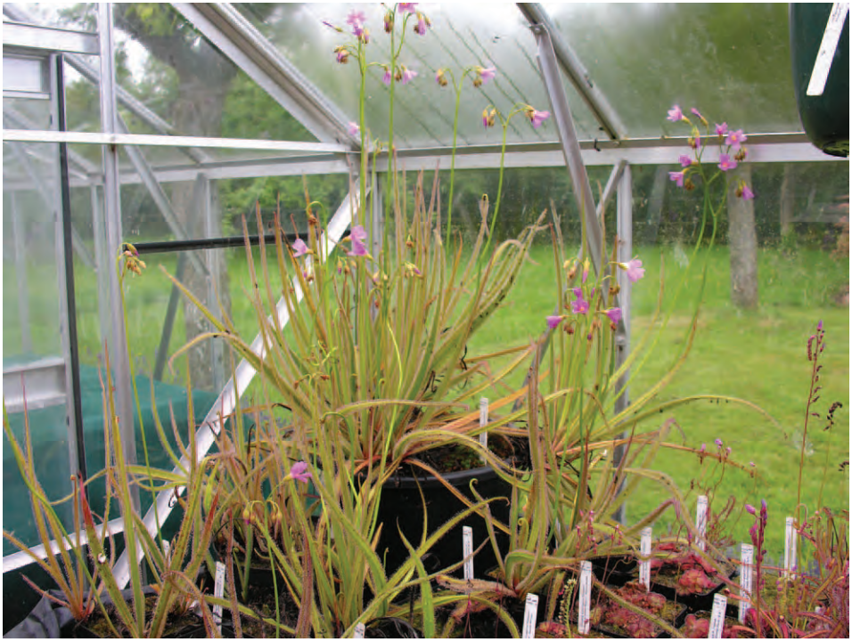
Figure 3: Adult Drosera regia plants.