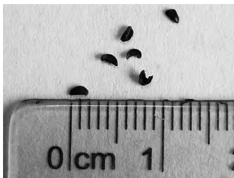
Figure 8: Close-up of fresh Drosera regia seed.

Root cuttings work well, and can easily be taken without disturbing the adult plant (which