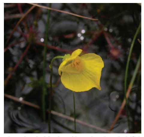
Figure 10 (left): Utricularia regia from the type location in Mexico. Note the deeply bifid, spreading upper corolla lobes, and the characteristic mark on the lower lip, resembling an inverted, 3-pronged crown. Photo by Ricardo de Santiago.

Figure 11 (right): Utricularia stygia , growing in a bog in southern Germany, accompanied by Drosera intermedia . This temperate bladderwort species was formally described at the time Taylor's monograph had already been completed, and thus is not separately included in that work.