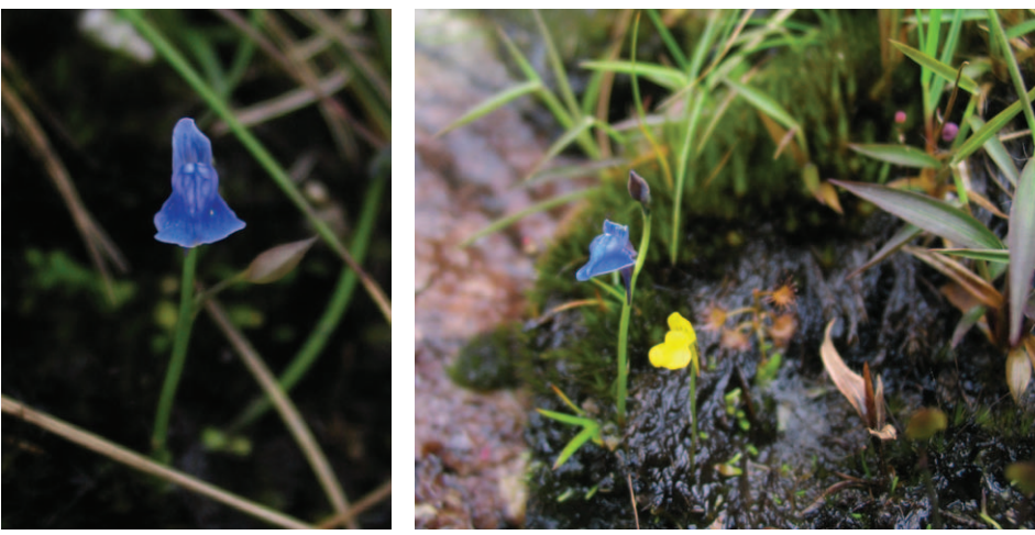
Figure 4: The bright ink-blue flowers of Utricularia babui plants, growing on Doi Inthanon of northern Thailand. At this location, the plants were growing sympatrically with a stunted form of U. recta (yellow flower on the right photo), which has been described as U. jackii (Parnell 2005).

babui (a single specimen on the holotype sheet) and stunted specimens of the yellow flowered U. recta <sup>2</sup>, which both grow sympatrically on Doi Inthanon of northern Thailand (see Fig. 4). Utricularia janarthanamii from the Western Ghats of India (Yadav et al. 2000) is perfectly matching the Philippine endemic U. heterosepala in all of its remarkable morphological characters - the absence of bracteoles (due to fusion with the bracts), a rather unusual feature in this group of bladderworts, as well as the unique and distinctive seeds with finely sinuate testa ornamentation. Therefore it is regarded as conspecific with U. heterosepala here, and extends the range of that species to western India. Like a few other species of Utricularia , U. janarthanamii is reported to exhibit both chasmogamous flowers with well-developed corollae, as well as much smaller cleistogamous flowers, the latter even developing underground (Yadav et al. 2000; Sardesai &