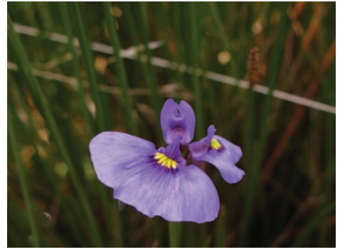
Figure 3: Utricularia beaugleholei in habitat in southern Australia and close-up of a flower. The flowers resemble those of the related U. dichotoma , however the latter has fewer yellow rims on the palate.