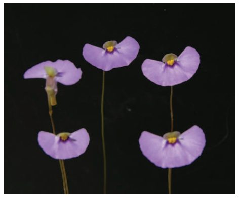
Figure 2: The showy flowers of Utricularia paulineae , plants cultivated by the author. On the left plants from the type location near Walepole, on the right plants with slightly distinct corolla shape and coloration from a different location in south-west Western Australia.

(see Fig. 4; A. Fleischmann, pers. obs. 2005; Suksathan & Parnell 2010). It obviously is closely related to U. graminifolia , from which it differs mainly in having narrower leaves which are vascularised by only a single vein (three nerves in the leaves of U. graminifolia ).