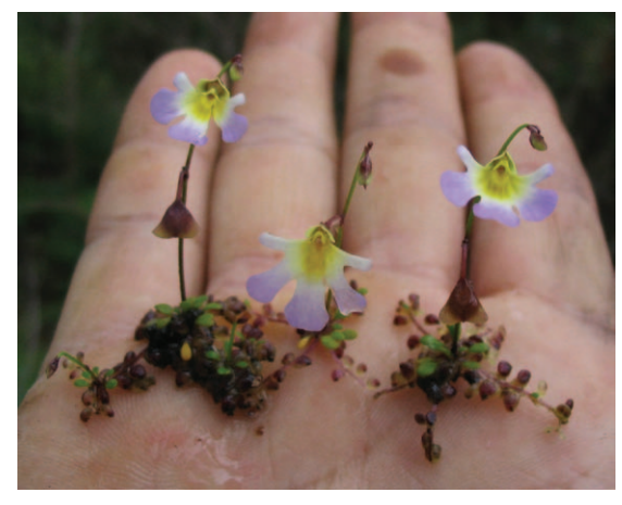
Figure 7: The impressive flowers of Utricularia inthanonensis , growing on wet vertical rocks on Doi Inthanon, northern Thailand.