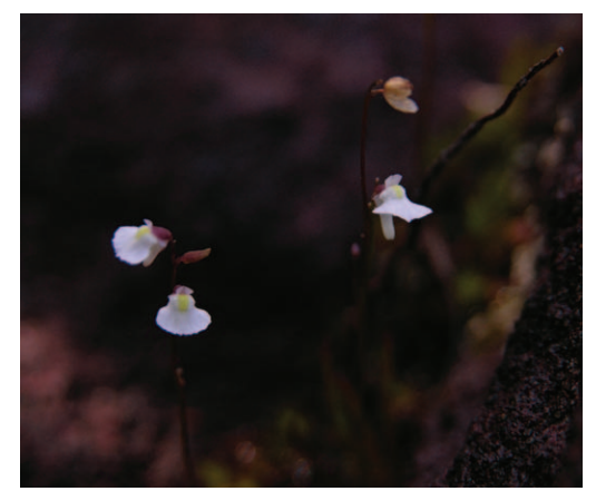
Figure 5 (left): Utricularia capillacea , an old species with a "new" name. This species was called U. scandens in Taylor's monograph, however it recently became evident that this name actually represents a younger synonym of U. capillacea . This photo shows a plant growing in Zambia.

Figure 6 (right): The delicate Utricularia rostrata growing in cracks of wet rock at the Chapada Diamantina, Brazil. Note the capsule, with a spreading lower calyx lobe which acts for seed dispersal.