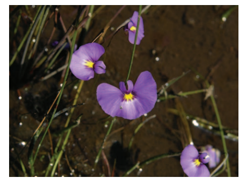
Figure 1: Utricularia petertaylorii , an annual bladderwort species from Western Australia that was named in honour of Peter Taylor. The plants on the left are growing together with U. multifida .