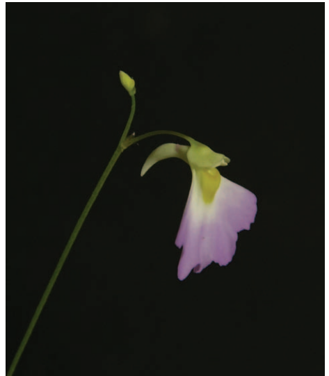
Figure 8: Utricularia moniliformis of Utricularia section Phyllaria , cultivated by the author. Not new to science, but much more widespread than Taylor (1989) assumed at the time, and one of the very few species of that intriguing group which seem to last in cultivation.