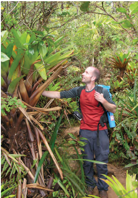
Figure 1: The author with Brocchinia tatei Mount Roraima, Venezuela.

Described by Robert Schomburgk in 1840, Utricularia humboldtii is a native of Venezuela, Guyana, and Brazil where, according to Taylor (1989), it is an epiphyte in bromeliad leaf axils or on mossy trees, and also as a sub-aquatic terrestrial in wet soil in open savannah or forest clearings. As an epiphyte it is sometimes found in the leaf axils of bromeliads, most notably Brocchinia tatei which can attain gigantic proportions (see Fig. 1). As a terrestrial it is seen in wet peaty soils, generally in highland savannah (see Fig. 2) alongside other Utricularia species amongst grasses where its' characteristic bright green, slightly waxy, coriaceous paddle-shaped leaves can be up to 60 cm in height, and with a leaf blade up to 10 cm high and 5 cm across, held atop red wiry stems (see Fig. 3).