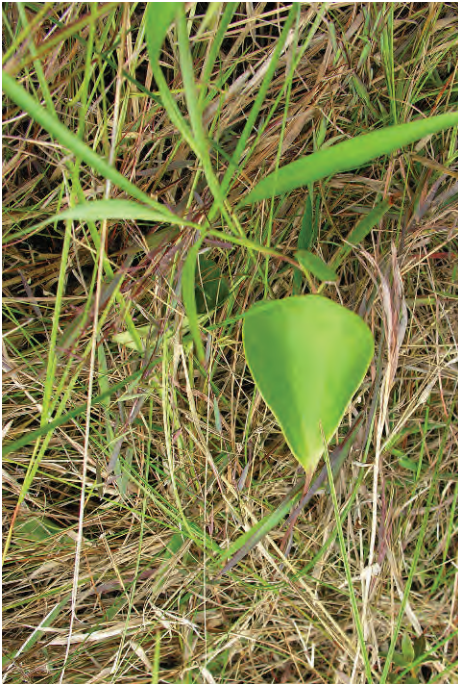
Figure 3: Utricularia humboldtii leaf blade.