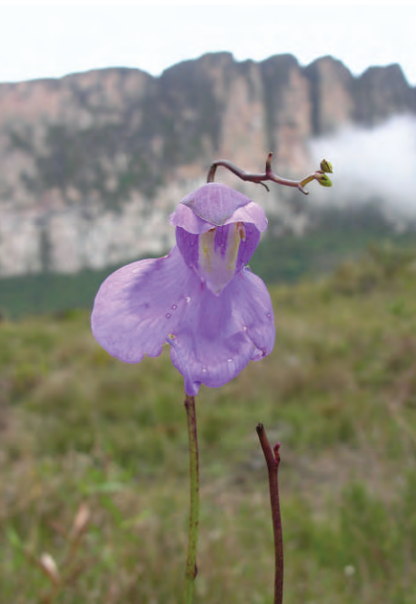
Figure 4: Flowering Utricularia humboldtii with Kukenam Tepui in the background.

Two distinct types of trap are produced, many small ones to 2 mm, and the occasional giant trap to 10 mm across as mentioned above.