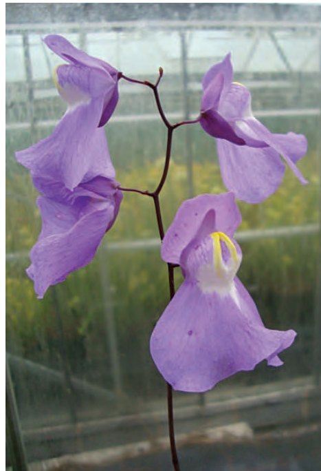
Figure 5: Utricularia humboldtii flowers in cultivation.

As with most Utricularia species, this plant is best propagated from division as it seems fairly vigorous, and further experimentation with allowing the plant to dry a little, may see this traditional shy flowering plant bloom more frequently.