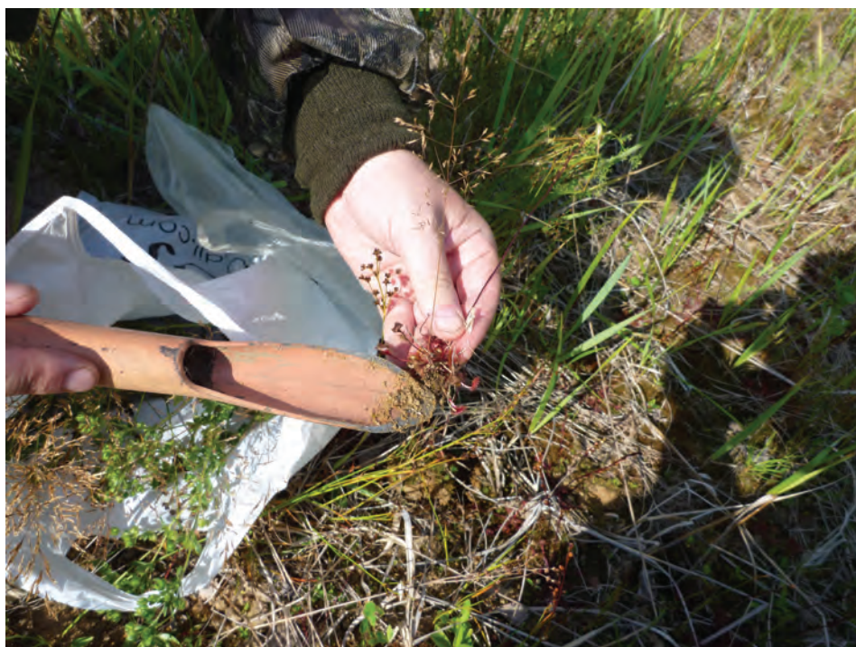
Figure 2: Collecting common sundew on dry sand.