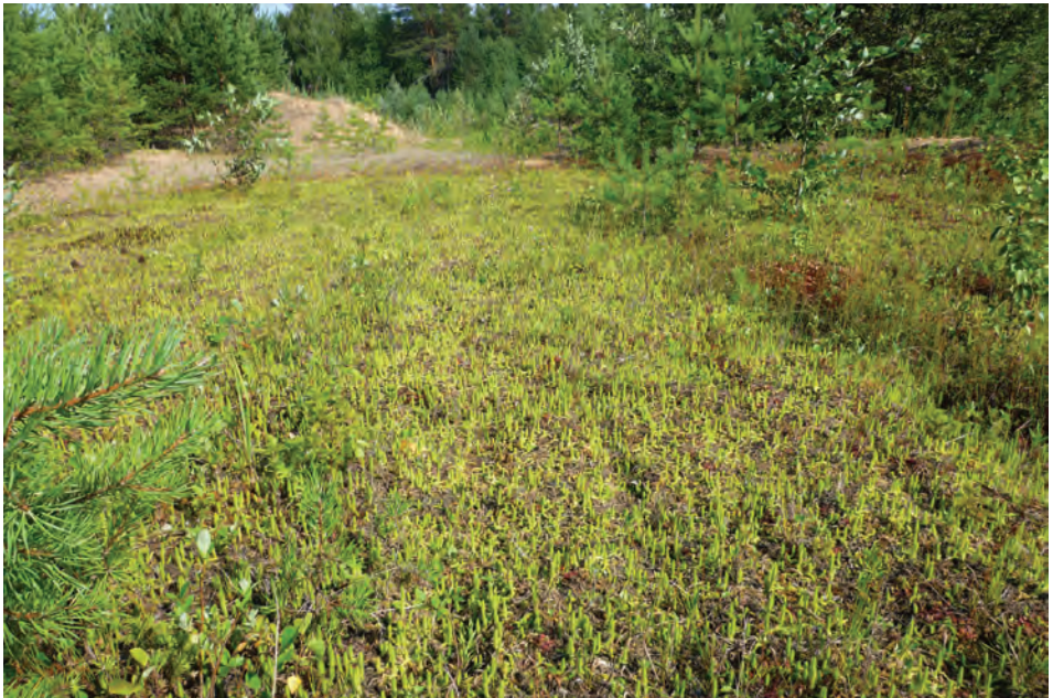
Figure 4: View of club moss – common sundew community on dry sand.