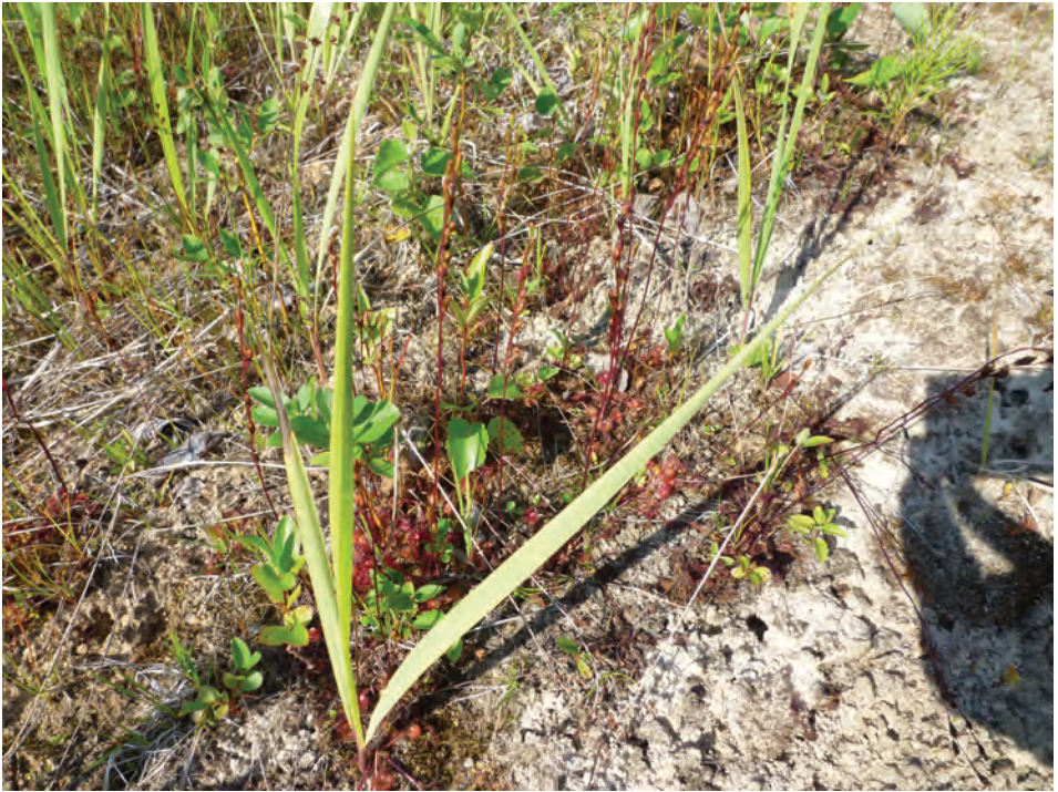
Figure 3: Drosera rotundifolia L. with Calamagrostis epigeios (L.) Roth on dry sand.