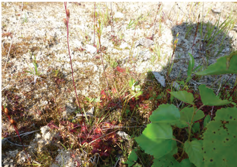
Figure 1: Common sundew on dry sand.