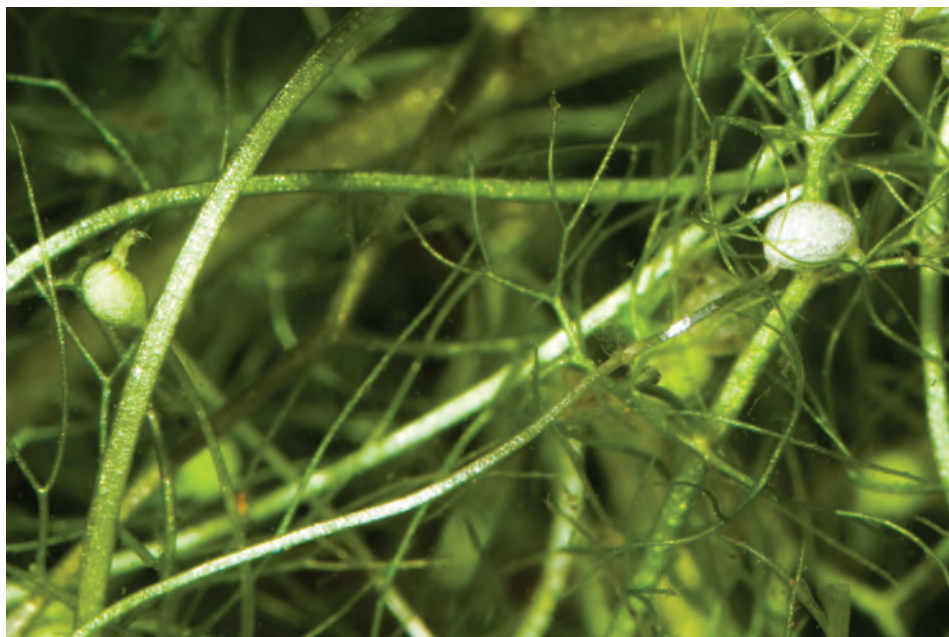
Figure 1: Utricularia inflata tubers on long, strand-like shoots. The tuber at far left has extruded a new growth.

The familiar Utricularia inflata also produces carbohydrate-rich tubers, although they are only a few mm in diameter (see Figure 1). Utricularia inflata is in the genus section Utricularia , which includes the most common aquatic or semi-aquatic species such as U. australis , U. gibba , U. macrorhiza , and U. vulgaris . (The related U. platensis also generates tubers.) Tubers can usually be found on large U. inflata plants, and their presence is a useful way to distinguish it from similar species (such as U. macrorhiza ). Supposedly, being stranded on mud is particularly conducive to encouraging U. inflata plants to produce tubers (Taylor 1989). But why the plant produces its tubers on whip-like shoots, several cm long, defies easy explanation!