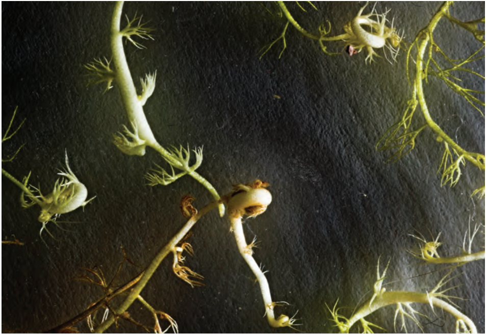
Figure 3: Utricularia radiata shoots with swollen sub-tuberous organs, twisted into short loops. The loops at top right and middle-left are starting to uncurl.