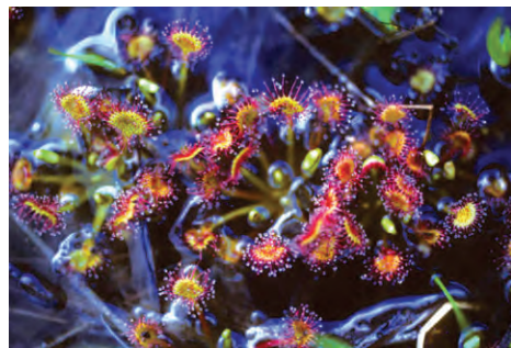
Figure 4: A red form of Drosera rotundifolia at Yongneup, Mt. Daeam, South Korea.