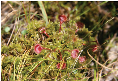
Figure 3: Drosera rotundifolia at Yongneup, Mt. Daeam, South Korea.