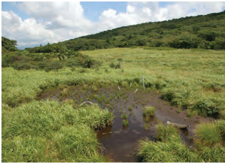
Figure 1: Yongneup, Mt. Daeam, South Korea.

In order to stop the extinction of other carnivorous plants in Korea, I traveled to different wetlands to actively find and protect them. One of my meaningful journeys was to Yongneup (see Figure 1).