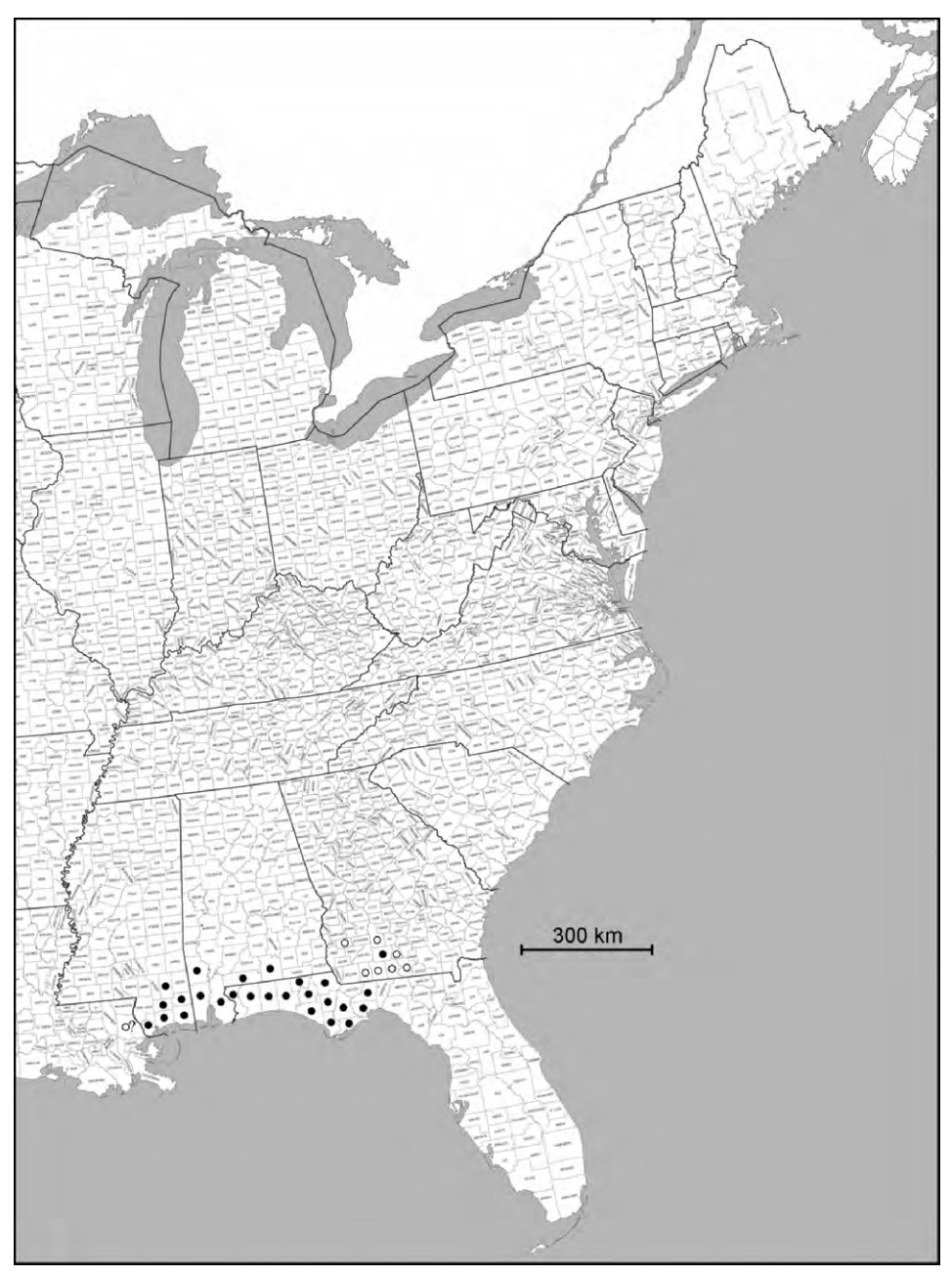
Figure 1: A 2010 snapshot of the range of Drosera tracyi . Counties or parishes believed to currently maintain native populations are indicated by a black dot. Counties where it is believed D. tracyi has been extirpated are indicated by an empty circle. The question mark for the Louisiana site notes that it has not been confirmed that Drosera tracyi has ever occurred there.