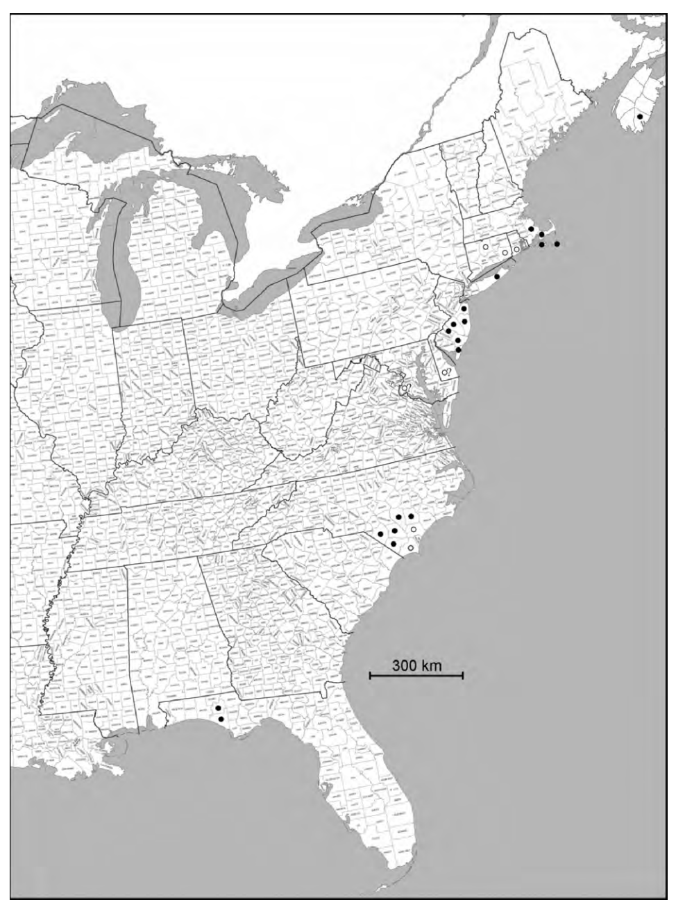
Figure 2: A 2010 snapshot of the range of Drosera filiformis . Counties believed to currently maintain native populations are indicated by a black dot. Counties where it is believed D. filiformis has been extirpated are indicated by an empty circle. Only native sites have been plotted. The question marks for the Delaware and Maryland sites note that it has not been confirmed that Drosera filiformis has ever occurred as a native at these locations.