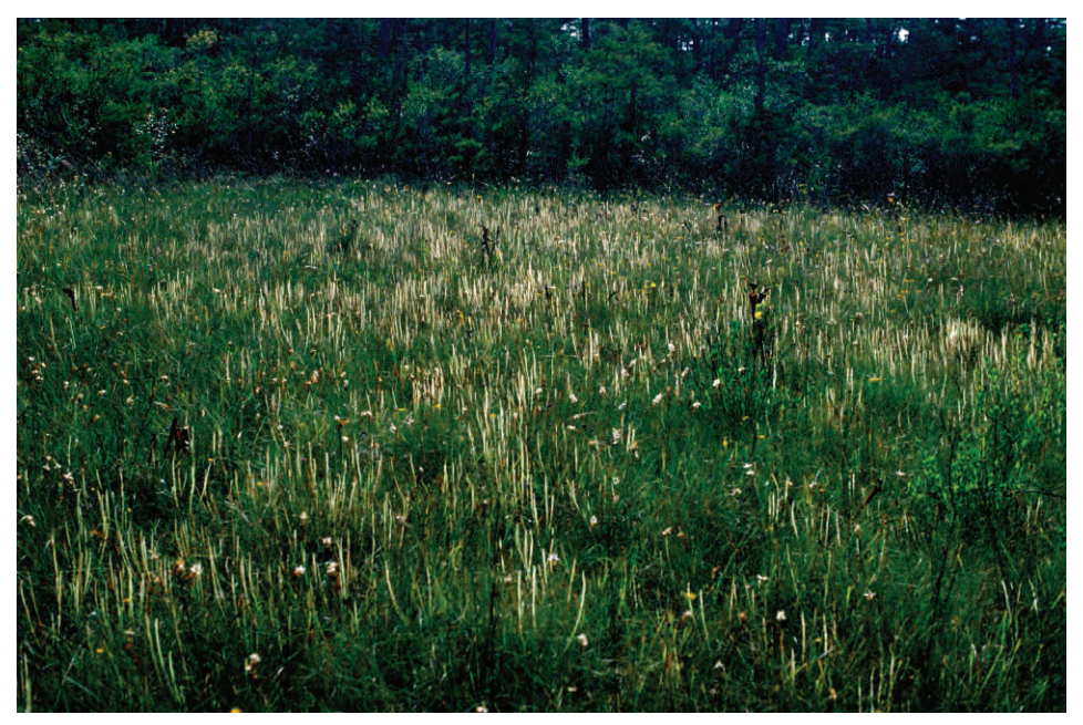
Figure 6: A familiar view of Drosera tracyi , backlit in the evening sunset (Liberty County, Florida).

different species concepts may come to different conclusions, and I do not fool myself into thinking I have had the last word on the subject of the two thread-leaf sundews. As Peter Taylor (1989) wrote, "Nothing is perfect, except perhaps the plants that we study and attempt to understand...."