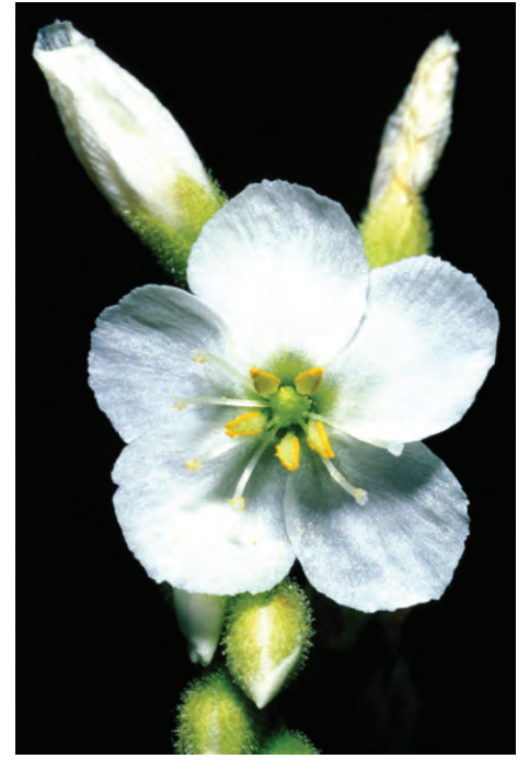
Figure 5: The white-flowering, mutant form of Drosera tracyi .

species when you consider the total ranges shown in Table 2—for example the number of flowers per inflorescence can range from 4 to 21 for D. filiformis and 12 to 20 for D. tracyi . The overlap here is significant, but the one-sigma ranges in Table 3 do differ much more clearly, i.e. , 7-15 for D. filiformis and 13-19 for D. tracyi .