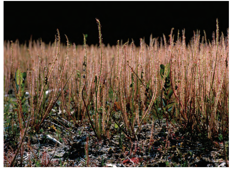
Figure 3: Drosera filiformis growing on sandy flats in New Jersey (Ocean County).