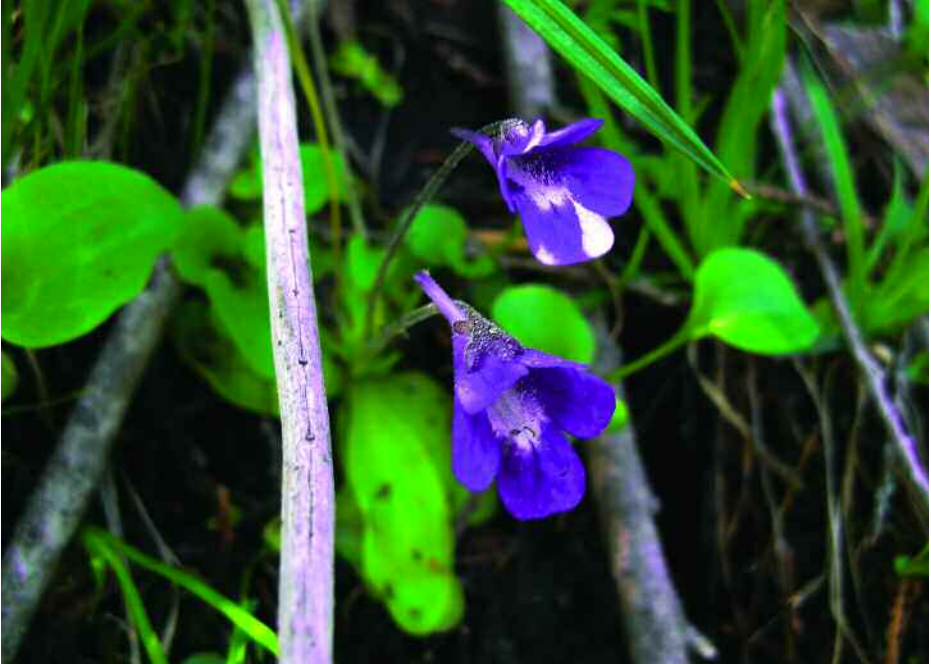
Figure 5: Two flowers from the Castle Craggs, California area. Notice the nearly overlapping lower corolla lobes and the minutely bifid spurs.