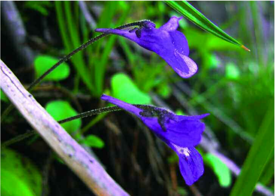
Figure 6: The same two flowers shown in Figure 5, in profile. Notice the long spurs.