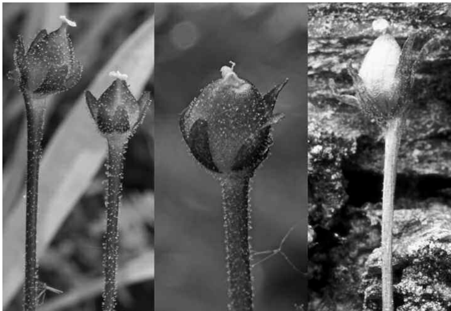
Figure 7: Pinguicula infructescences from sites discussed in the text: California (left), Oregon (middle), Montana (right). Images are not all at the same scale.

Plants in this geographic range were included in the list of specimens examined by Casper (1962), and treated by him as P. macroceras . How should the plants in this pocket population be classified? It is unclear as too few plants were measured to make a statistically significant statement, or to create reliable character ellipses as in Figures 1 and 2. The nature of the corolla lobes is consistent with just about any of the three entities we have discussed; we will allow future workers to puzzle this issue more fully.