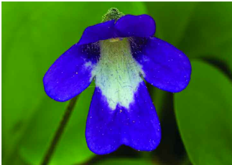
Figure 4: A flower from the Castle Craggs, California area. Note how the lower corolla lobes are spreading in this specimen, and the emarginate central-lower lip.