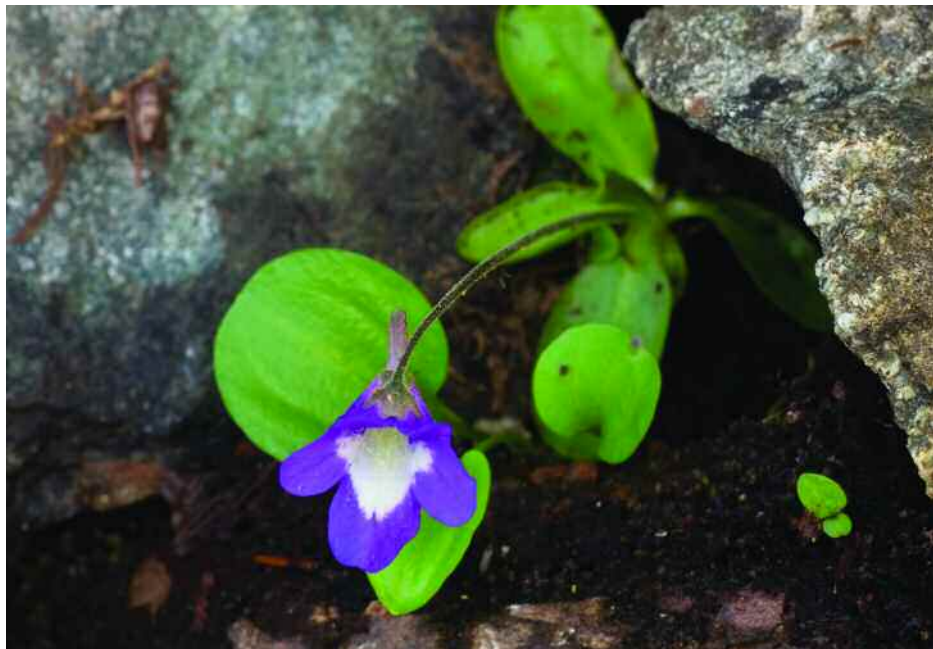
Figure 3: A plant from the Castle Craggs, California area. Note how the lower corolla lobes tend to overlap, suggesting the identification as P. macroceras subsp. macroceras .