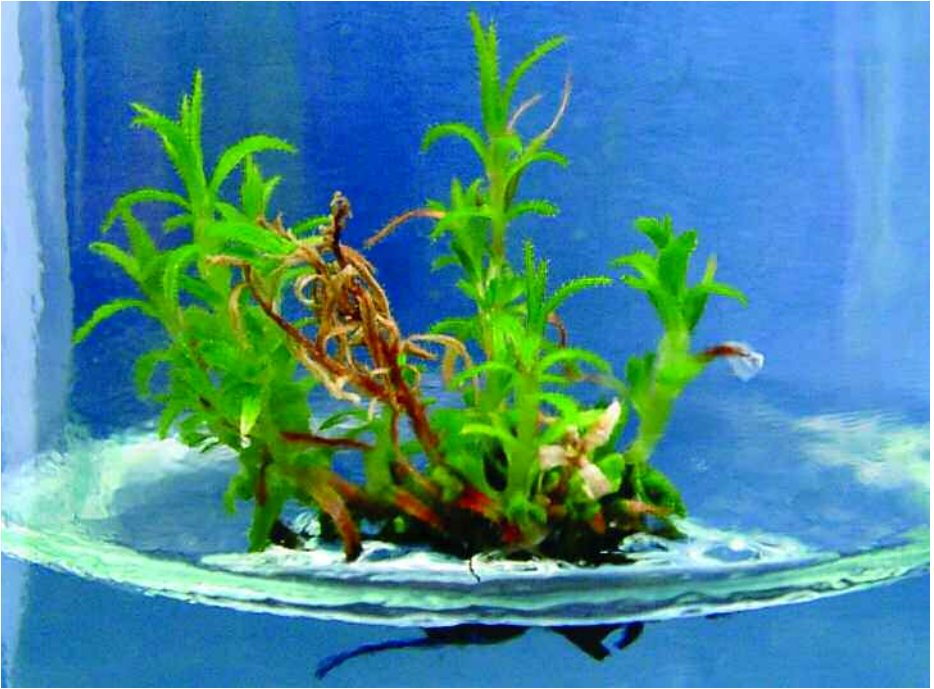
Figure 1: Roridula gorgonias in vitro .