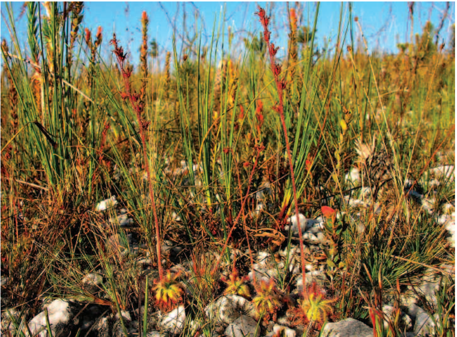
Figure 2: Drosera schwackei (Diels) F.Rivadavia plants.