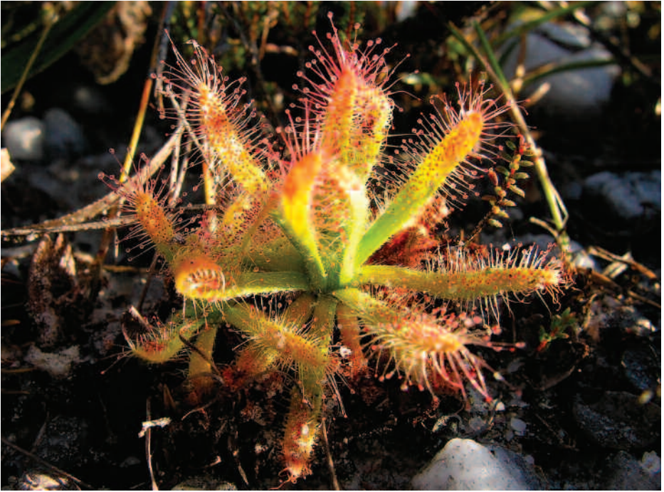
Figure 1: Drosera schwackei (Diels) F.Rivadavia rosette near Diamantina, Brazil.