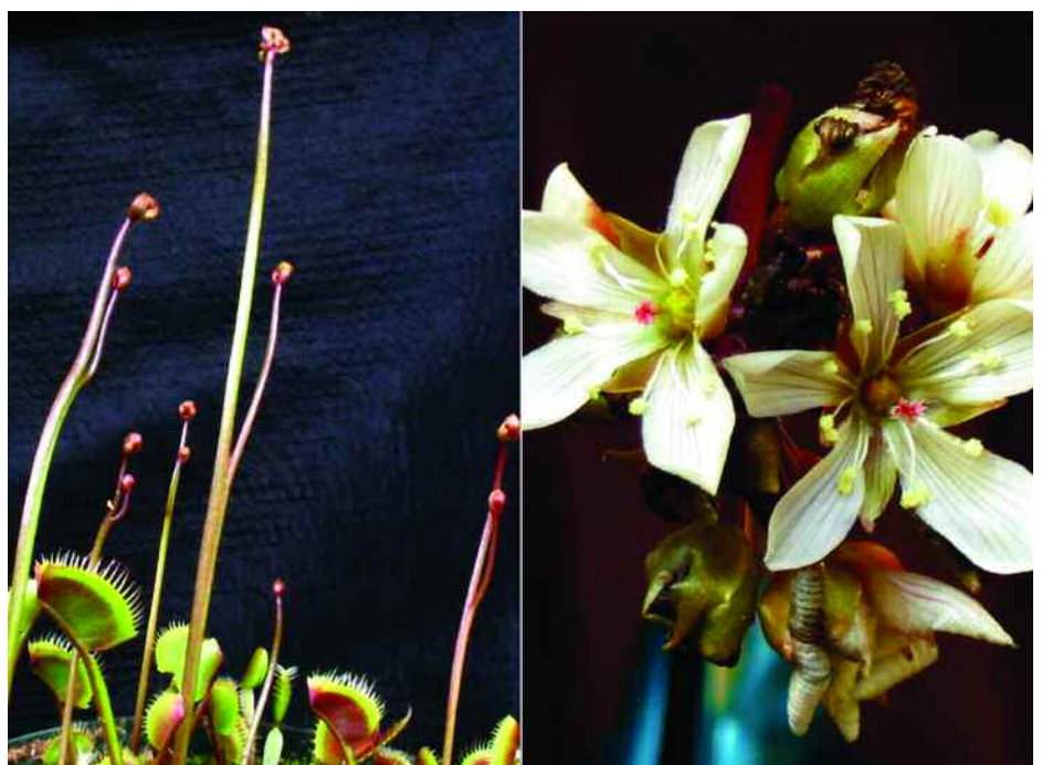
Figure 2: Dionaea muscipula 'Petite Dragon': bifurcated flower scapes in spring before greenhouse-grown plants have attained full red coloration (left), and flowers with red stigmas (right)