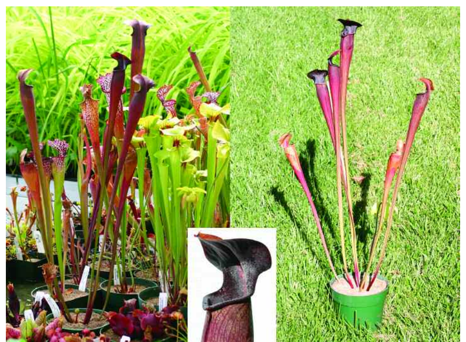
Figure 3: Sarracenia 'Night' The plant pictured was grown in a very bright greenhouse in Davis, CA.

The nomenclature of the red forms of S. alata is rather vague. Don Schnell (2002) mentions red S. alata plants, but he does not establish a name for them at the variety or from rank. Peter D'Amato (1998) mentions plants, using the descriptor "nigrapurpurea," to indicate specimens that have dark red or nearly black pitcher lid undersides. This term should be avoided since it has never been formally described, but the characteristics of S. alata 'Night' would appear to be similar, if not identical.