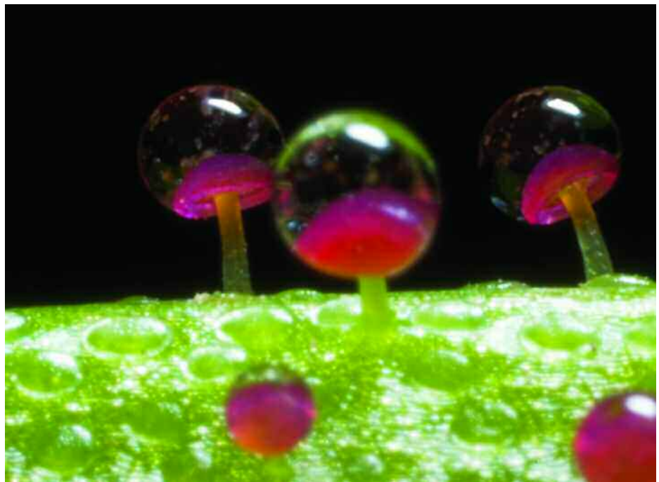
Figure 4: Extremely high power imagery showing the mushroom-like shape of Drosophyllum mucous glands.