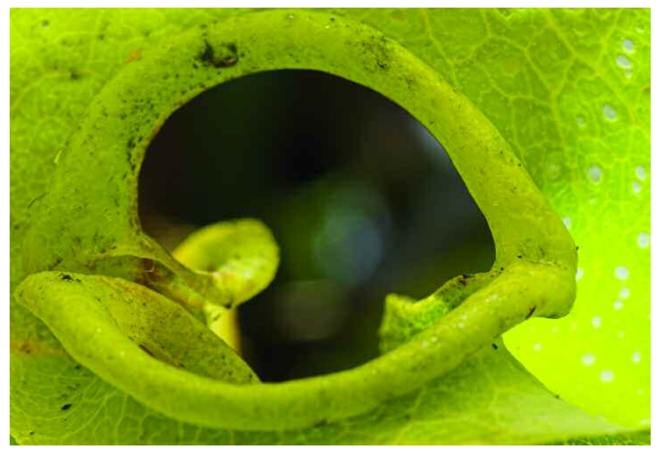
Figure 1: Inside a Darlingtonia pitcher, looking out. Notice how difficult it would be to reach the entrance corridor once prey find themselves inside the pitcher. The treacherous pitfall is at the far right. Note how dark the escape aperture is, when compared to the illuminated pitfall. Photograph made in natural light.