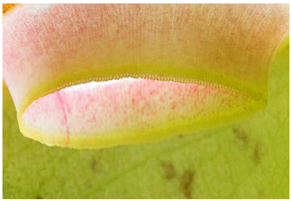
Figure 2: The entrance corridor into a Nepenthes ampullaria pitcher.

Figure 1: Inside a Darlingtonia pitcher, looking out. Notice how difficult it would be to reach the entrance corridor once prey find themselves inside the pitcher. The treacherous pitfall is at the far right. Note how dark the escape aperture is, when compared to the illuminated pitfall. Photograph made in natural light.