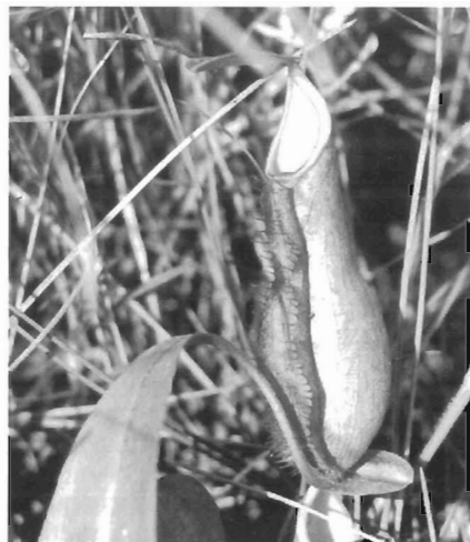
Figure 1: Nepenthes anamensis in Thailand.

in sandy areas, while U. bifida and U. delphinioides grew along the trail within pools and depressions in the peat bog.