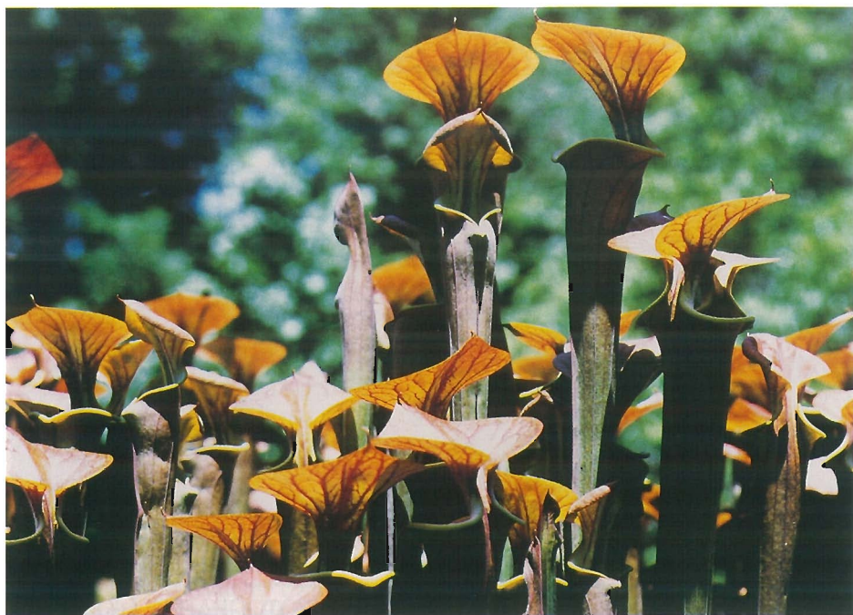
Figure 1: David Ahrens— Sarracenia flava .