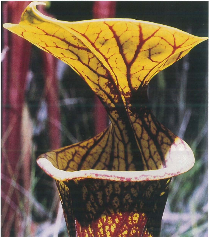
Figure 4: David Ahrens— Sarracenia flava lid.