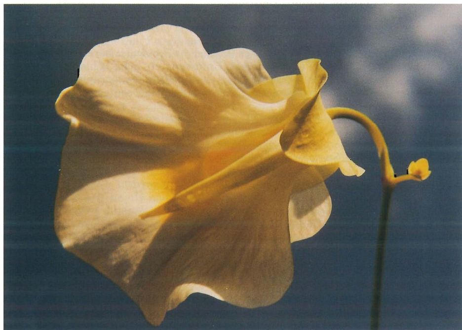
Figure 2: Eric Schlosser— Utricularia alpina .