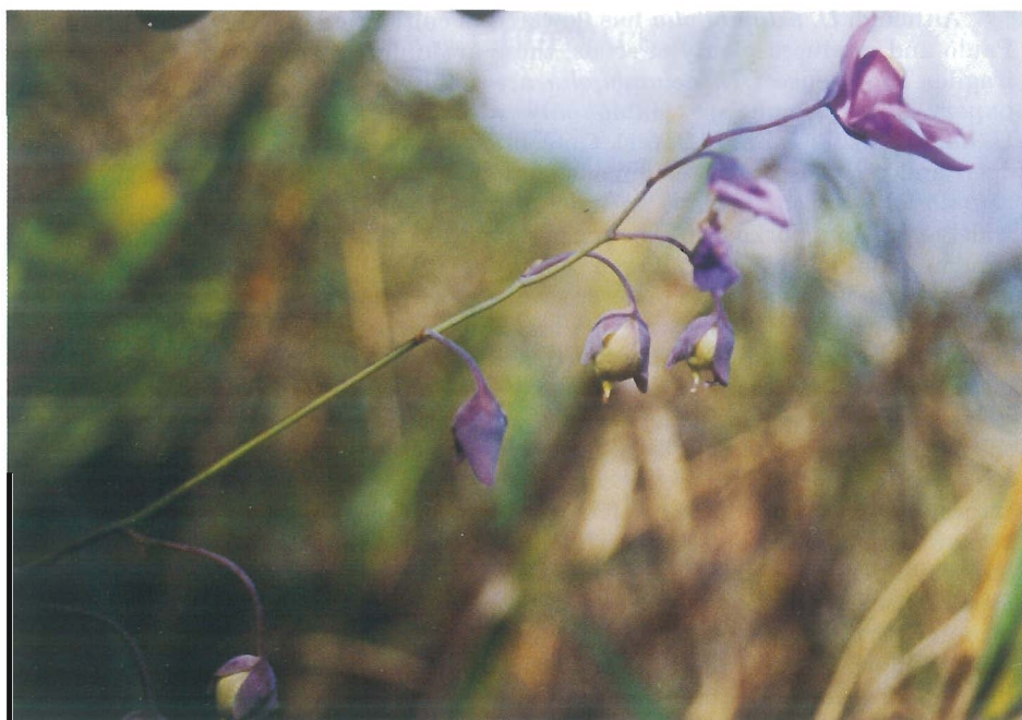
Figure 3: Fruit and flowers of U. nelumbifolia at Serra dos Órgãos.

Anyway, back to the Serra da Araponga, where after a few hours of studying, photographing, herborizing, collecting, and simply drooling over U. nelumbifolia , we finally agreed to trudge back downhill towards the car. Our feet ached tremendously from the strain of attempting to keep our balance for so long on that steep diagonal incline where the bromeliads grew. The heat and intense sunlight on that treeless terrain had been a bit of a problem too, but I am sure it would have been much worse if it had rained. I would not like to find out how slippery that smooth bromeliad-covered rock surface becomes when wet!