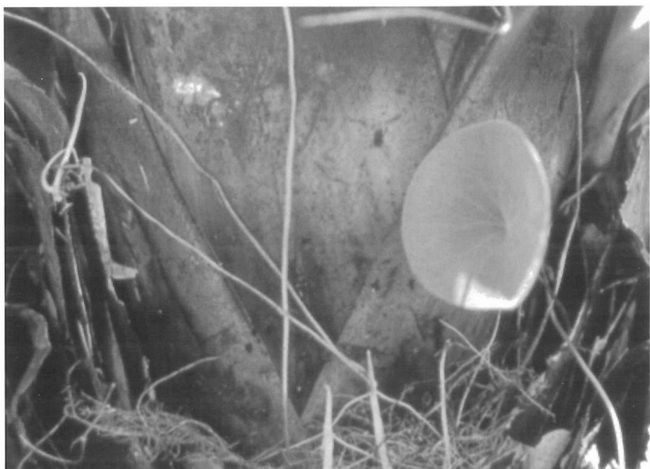
Figure 2: The outer leaves of V. extensa removed to reveal U. nelumbifolia .

1) Although aerial stolons may reach more than a meter in length (Taylor, 1989), I noticed that each one usually lands only 5-20cm away from where it originally emerged. Furthermore, I observed that the host bromeliads were usually located too far apart from each other to be within the reach of U. nelumbifolia aerial stolons arising from neighboring plants. Therefore the aerial stolons almost always grew out of and back into the same bromeliad.