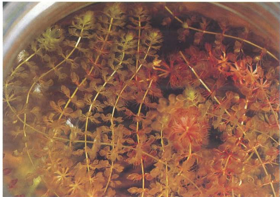
Figure 2: Aldrovanda vesiculosa from southeast Australia in a 3-liter aquarium, October 1998.