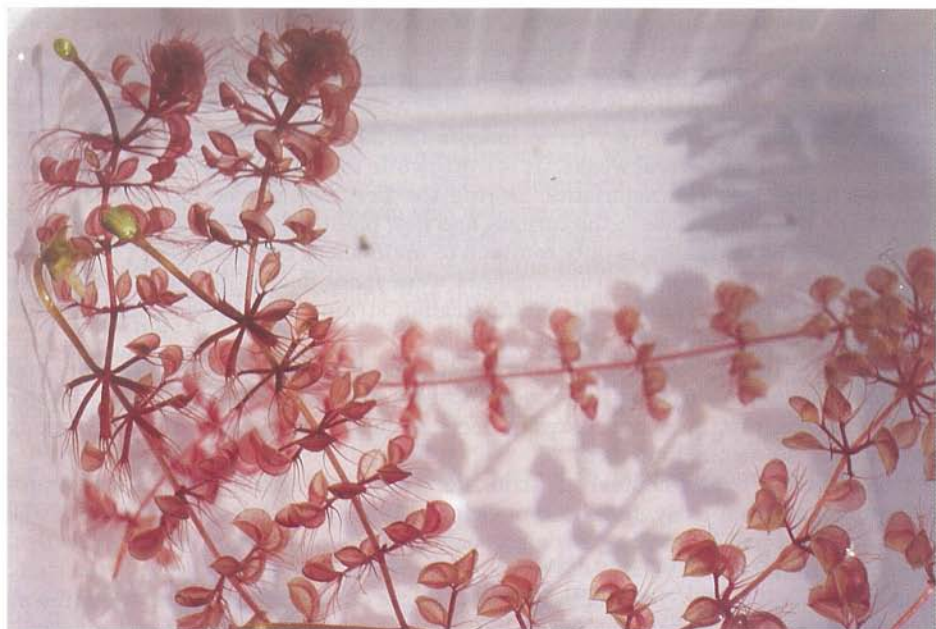
Figure 1: Flowering Aldrovanda vesiculosa from north Australia grown in indoor aquarium, September 1998.