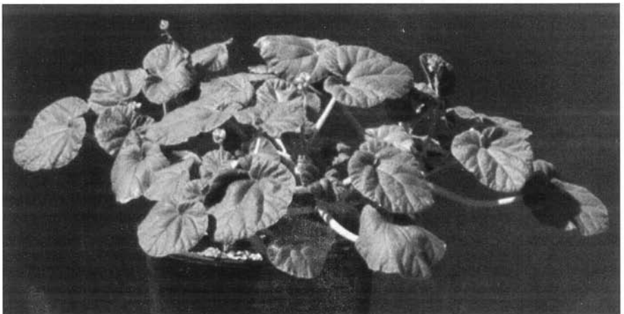
Figure 1: Ibicella lutea .

I have noticed Ibicella has two flowering phases during its long growing season. The first phase occurs when the plants are just a few months old. The fruit from this first phase of flowering mature in only a month or so. After these first few flowers, the plant stops flowering and concentrates upon growing larger. The second phase of flowering starts when the first crop of seeds are nearly mature. In my cultivation this phase continues until the plants are killed by frost. Fruit take up to three months to mature and grow to 16 cm or longer. Pollinate flowers from the first phase because you may not have the long growing season required to get seed from later flowers. Incidentally, Ibicella has sensitive stigmatic lobes that when touched, quickly flex out of the way and enclose the applied pollen. This is obviously an adaptation to avoid self-pollination by pollen-coated insects backing out of the flower. (It appears that moving stigma lobes only occur in the order Scrophulariales, which includes Ibicella and the carnivorous genera Pinguicula , Genlisea , and Utricularia .)