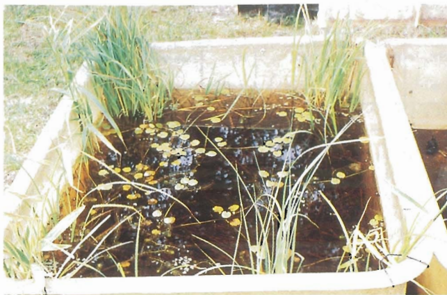
Figure 2: Outdoor cultivation of Aldrovanda vesiculosa , July 1993.

them even produced seeds. The same cultivation technique may be used to all aquatic Utricularia species.