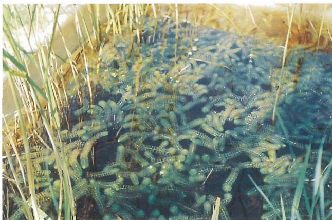
Figure 3: Outdoor cultivation of flowering Aldrovanda , July 1994.

Throughout the 1994-1996 growing seasons, the plants suffered from a disorder. Shoot apices stopped growing as early as in the middle of June and were small, yellowish, flat, and were without typical bristles. As the disorder progressed, the apices became brown and began to die. Damaged plants produced non-functional turions. This disorder has not been observed in naturally occurring plants. Moreover, damaged plants became healthy very quickly once placed in natural habitats. Since no parasite was ever observed in the damaged apices, it was evident the disorder resulted from a mineral nutrition problem, namely a Boron deficiency. After H_3BO_3 was added to the culture medium ( 0.6 \text{ mg l}^{-1} ), plant growth resumed after a few weeks and the shoot apices returned to good health. It is presumably possible to prevent the disorder by adding a greater amount of clay to each container, since a variety of micronutrients, including Boron, will be continuously released from this substrate. At the first sign of the disorder, it is recommended to add H_3BO_3 , striving for a final concentration of 0.5 \text{ mg l}^{-1} .