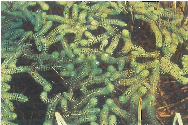
Figure 1: Aldrovanda vesiculosa flowering in cultivation. The flowers are 6–7 mm in diameter, July 1994.

As a result of the extremely hot summer of 1994, 138 plants flowered and 17 of