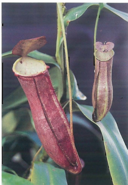
Figure 2: N. gracilis cv. 'Nighttime Regal'