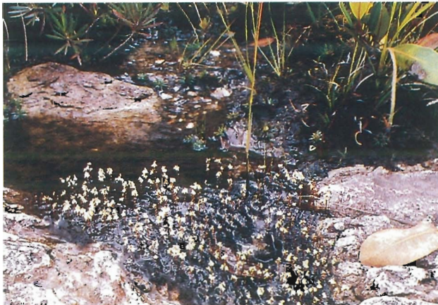
Figure 1. Utricularia neottioides growing in a shallow, rocky stream near Chapada dos Veadeiros, Brazil.

Taylor, Peter. 1989. The Genus Utricularia - A Taxonomic Monograph. Kew Bulletin Additional Series XIV, Royal Botanic Gardens, Kew.