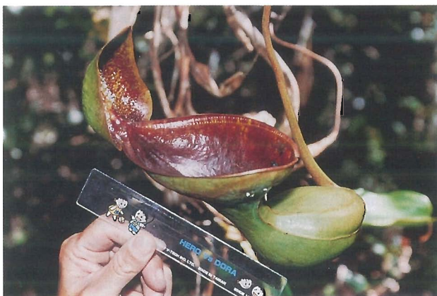
Fig. 3 -- N. lowii pitcher.

and had an orifice of almost 15 cm in the long dimension. Inside one pitcher we found some frog eggs. Our guide mentioned that larger plants might be found higher up, but I was much too tired to continue upward. We still had a long and tricky hike back down the hillside, and I opted to return to the jalopy rather than search for more N. rajah .