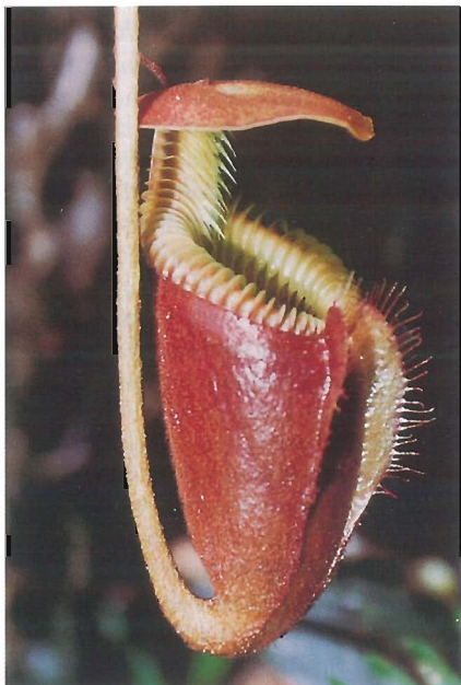
Fig. 2 -- N. villosa pitcher.

Farther up the hill we arrived at a small clearing. Two trees in the clearing had red spray paint marks on them which signified that we were entering the Park boundary. We hiked about 1/2 km up the hill from the clearing, and finally found N. rajah . There were three plants growing within 5 m of one another, and though they were larger than the ones I saw in the mountain garden they still were not fully grown. The largest pitcher was about the size of an American football,