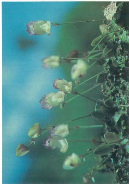
Utricularia jamesoniana —South America.