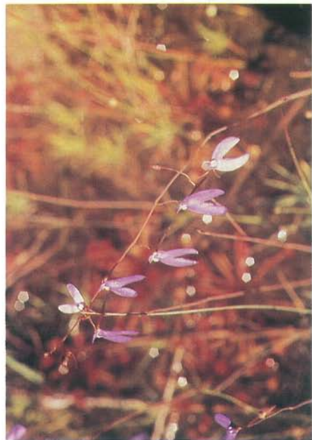
Utricularia leptoplectra —Near Darwin, Australia.