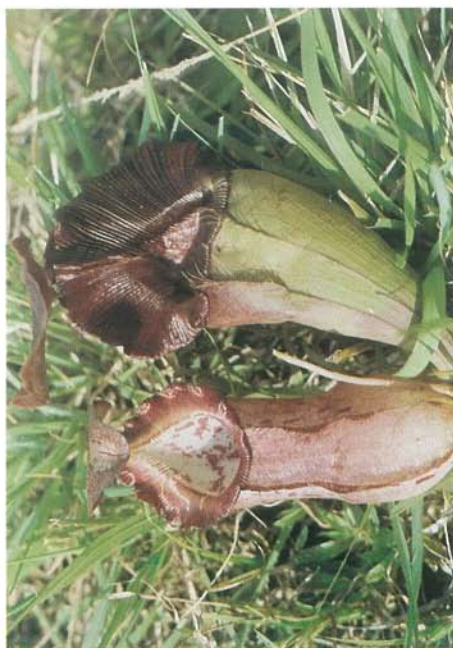
New Nepenthes species from G. Pangulubao Sumatra