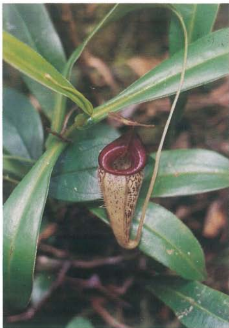
N. bongso From G. Talang