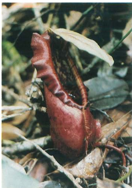
N. northiana lower pitcher