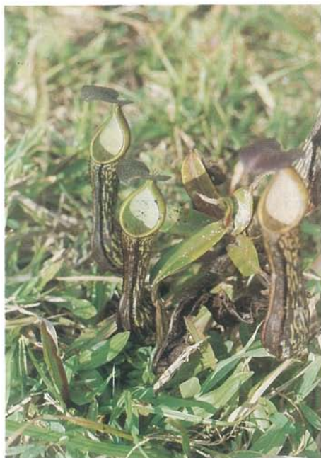
N. sp. 'New Species' From G. Pangulubao