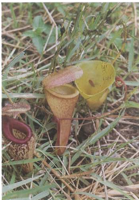
N. spectabilis (left) N. bongso x N. inermis (middle) N. inermis (right)