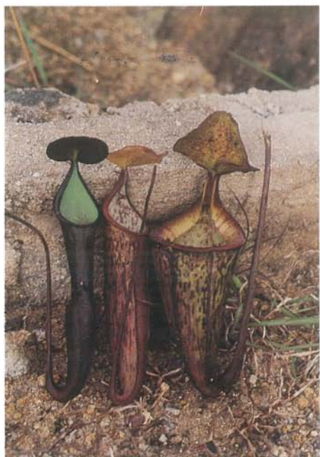
N. gracillima (left) N. gracillima x N. macfarlanei (middle) N. macfarlanei (right)