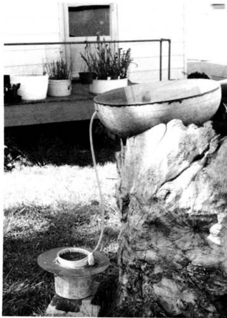
Cultivation apparatus for D. linearis .

After setting this up and letting it run for a few days, I collected some plants and subjected them to a very meaningful test. I put fresh plants into the same marl that killed the previous plants. How cruel! Deliberately sending sundews to their seemingly certain doom. Definitely not a test for the faint of heart. Week after week I checked the culture and was greeted by their fully adorned glistening tentacles, just like the wild plants. The culture plants formed their hibernacula at the same time as the wild plants in early September after a cooler than normal August. Just as in a natural habitat this apparatus closely mimics the natural purging process of the seeps of a marl fen.