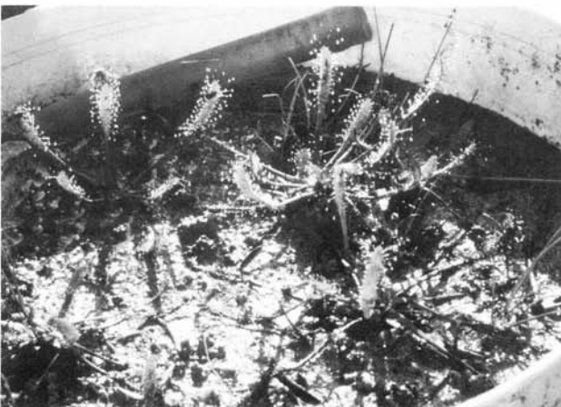
D. linearis in cultivation.

(Ed. Note. In a North American marl bog, the soil substrata is not pure marl (calcium carbonate) except possibly in the upper 1-2 mm. The "marl soil" is actually a mixture of marl, peat and sand in varying proportions).