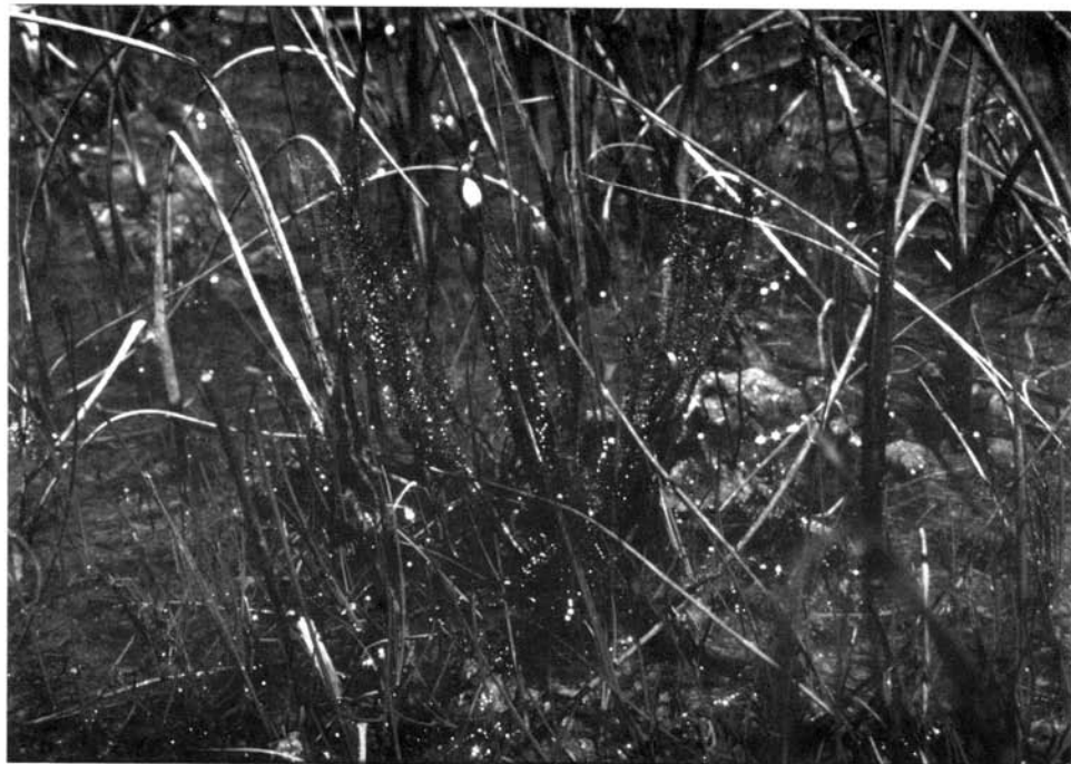
D. linearis in habitat growing in shallow water.