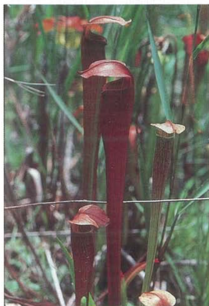
FIGURE 7— S. alata with deeper red tops and “red throats.”