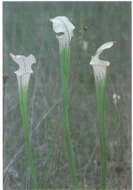
FIGURE 4— Pitchers of S. leucophylla with no red; flowers were yellow.