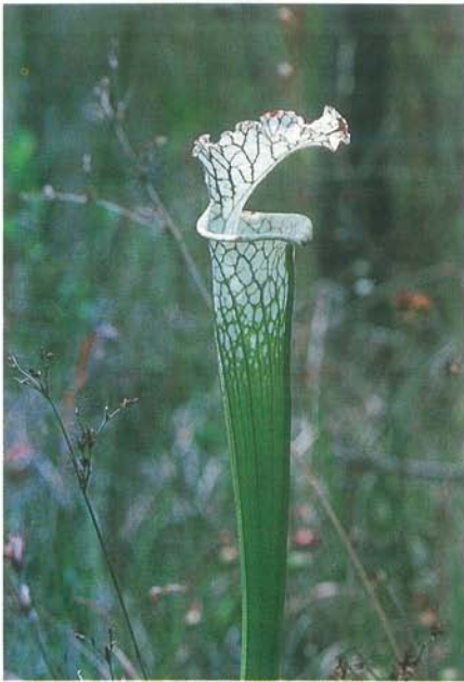
FIGURE 1— A typical plant of S. leucophylla with little red venation.