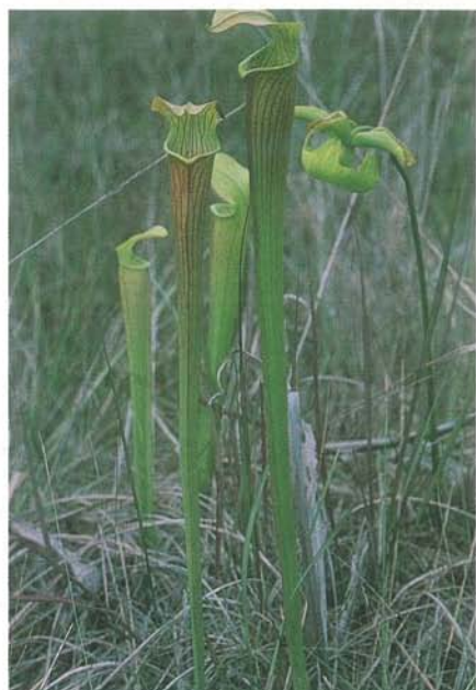
FIGURE 6— Typical clump of S. alata with mixed mostly green to lightly veined pitchers.