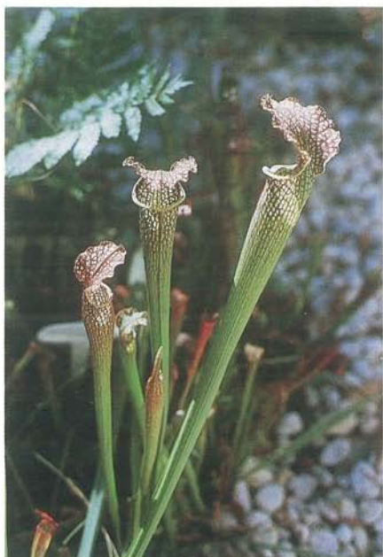
FIGURE 5— Probably introgressive of some other species into S. leucophylla , most likely S. rubra .