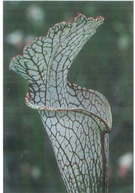
FIGURE 2 AND 3— S. leucophylla with more red venation.