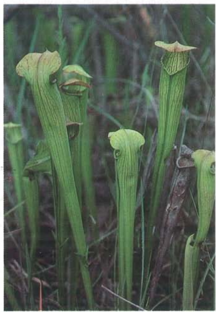
FIGURE 8— “Sticky, pubescent form” of S. alata .