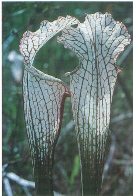
FIGURE 2 AND 3— S. leucophylla with more red venation.