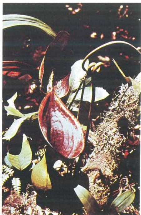
Nepenthes lowii Hook. f.