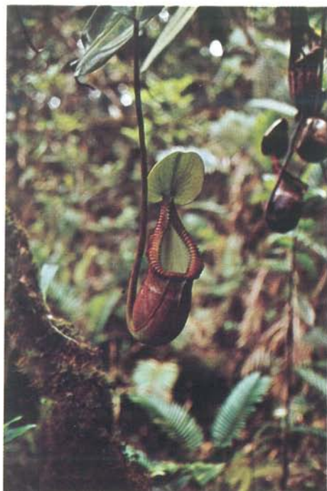
Nepenthes edwardsiana on Trusmadi