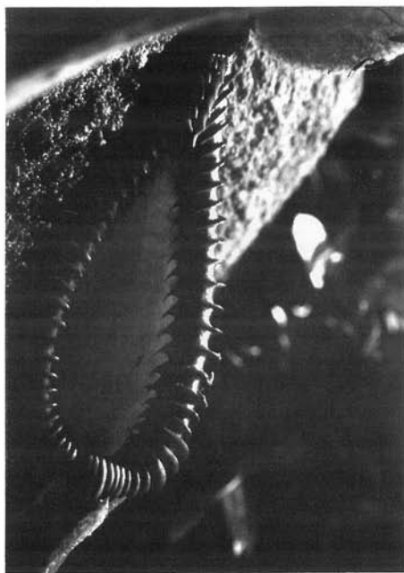
Peristome of N. edwardsiana Hook. f.