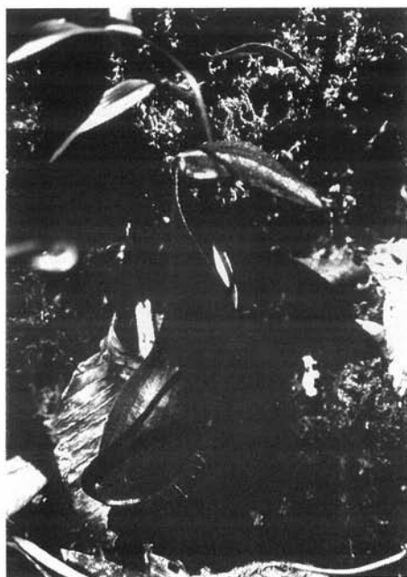
Nepenthes tentaculata Hook. f.