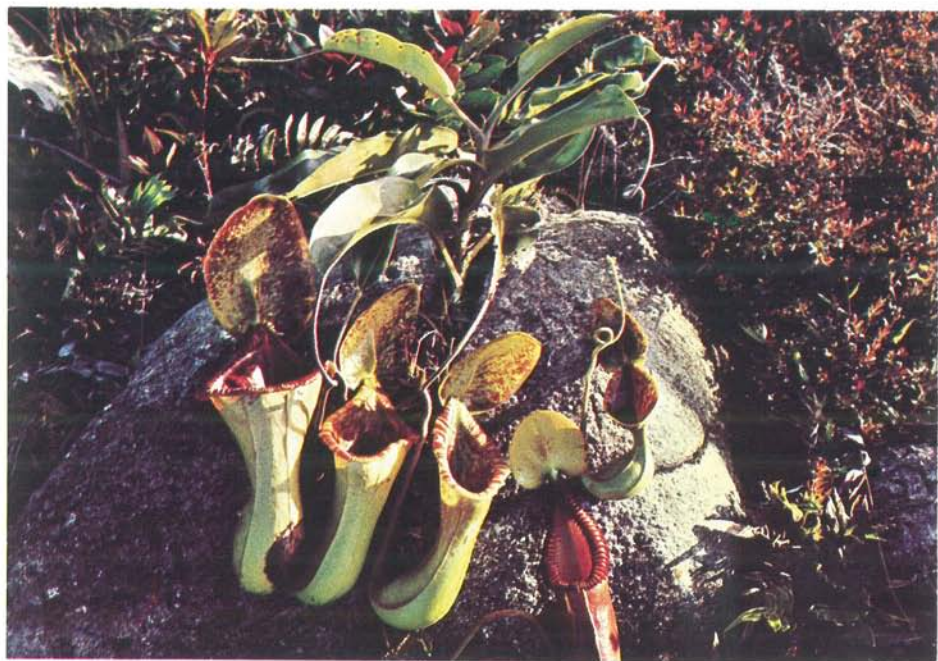
The new hybrid: Nepenthes x trusmadiensis Marabini ( N. edwardsiana \times N. lowii )