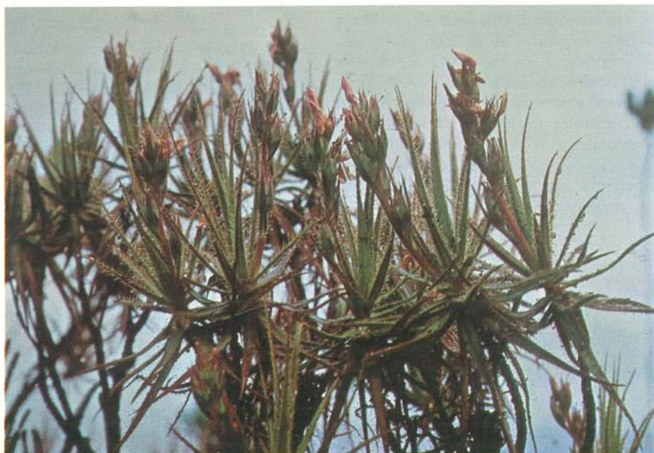
Roridula gorgonias at Fernkloof.