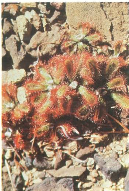
Drosera aliciae at Fernkloof growing mainly on the paths.