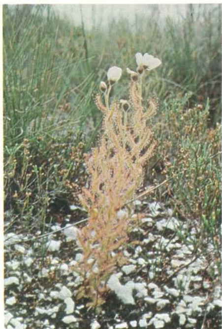
Drosera cistiflora at Table Mountain.