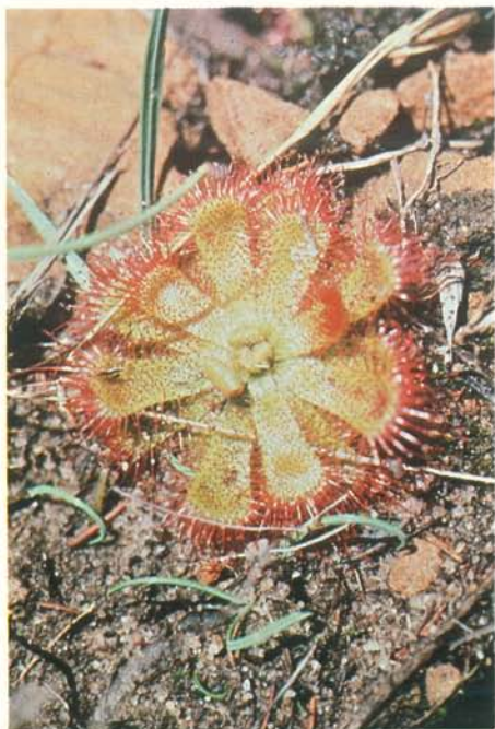
Drosera trinervia at Table Mountain, R.S.A.