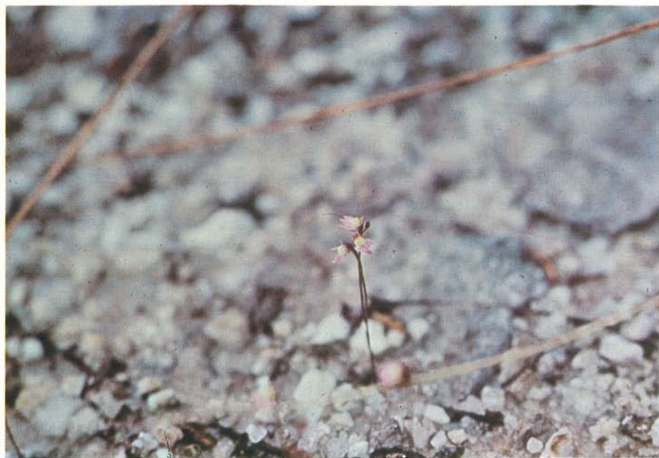
Utricularia capensis , purple flower at Fernkloof.