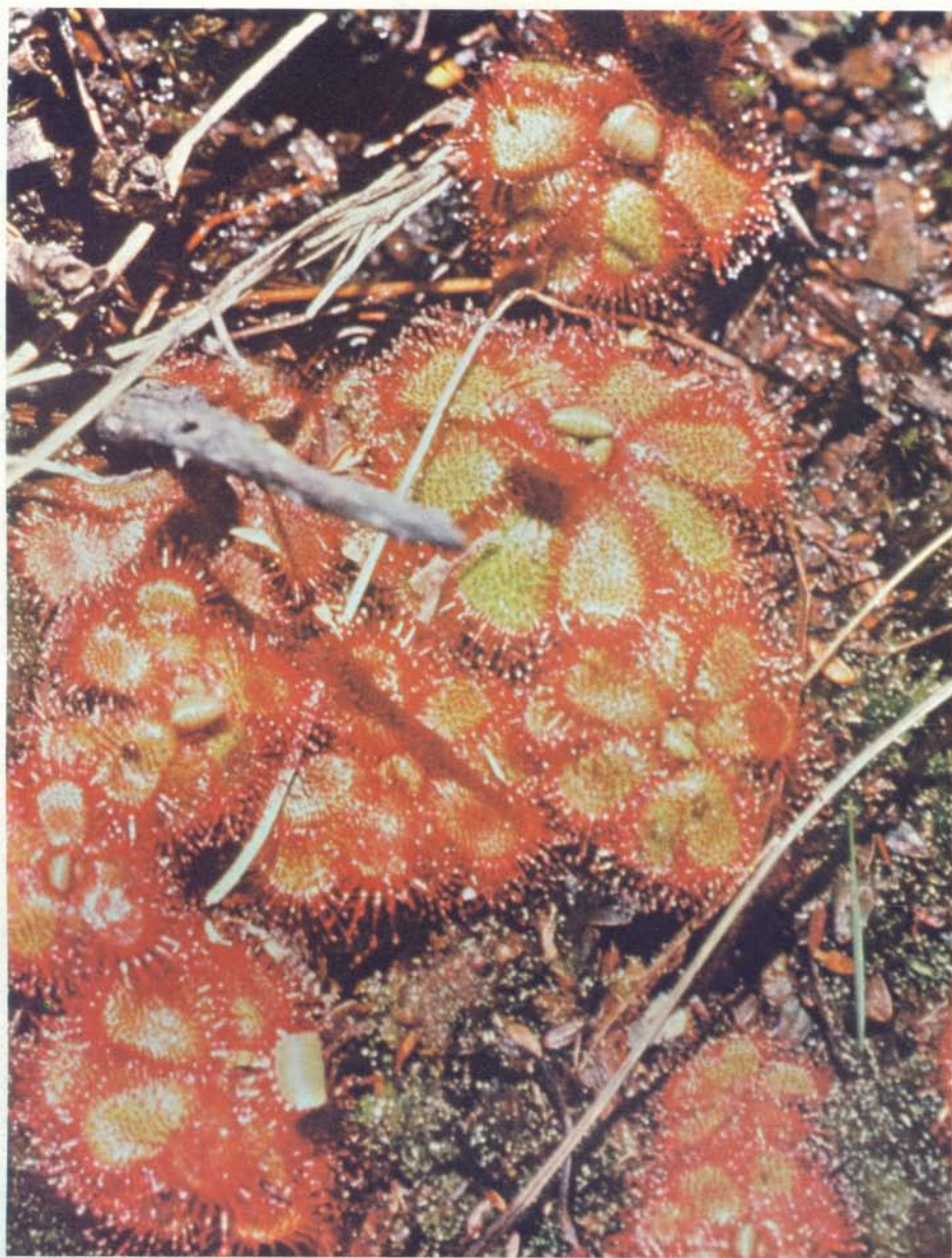
Drosera cuneifolia at Table Mountain, Republic of South Africa.