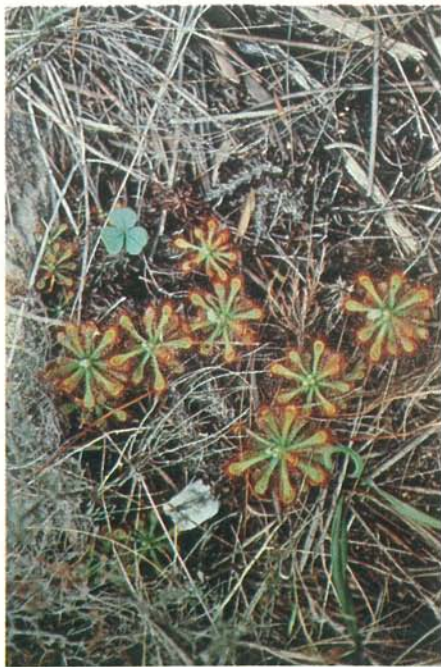
Drosera glabripes at Fernkloof, R.S.A. Utricularia capensis , purple flower at Fernkloof.