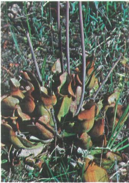
Fig. 5. ssp. purpurea in a sphagnum bog.