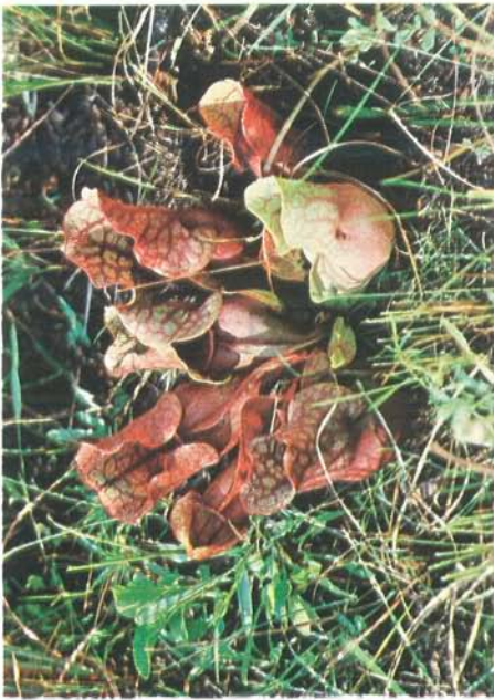
Fig. 1. S. purepurea ssp. venosa in coastal North Carolina.