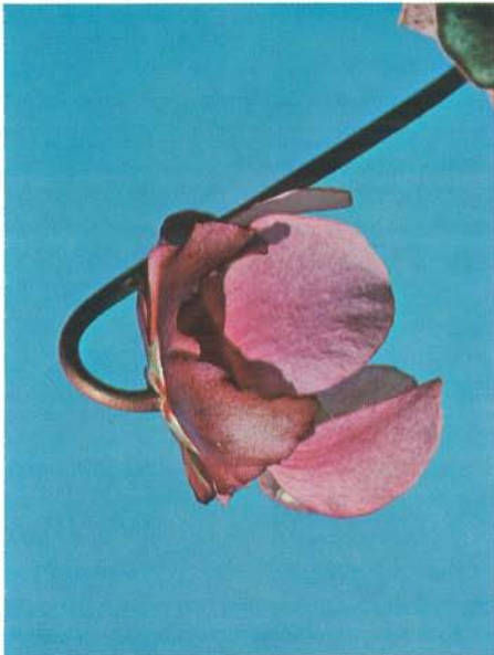
Fig. 3. ssp. venosa "Louis Burk" flower. Note pink petals and somewhat lighter sepals.