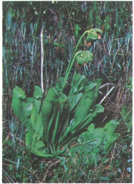
Fig. 6. ssp. purpurea f. heterophylla .