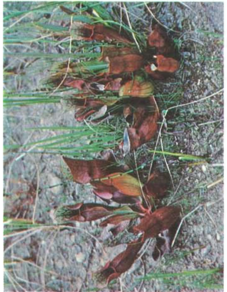
Fig. 8. ssp. purpurea growing in a northern marl fen as "ripicola" habitat variant.