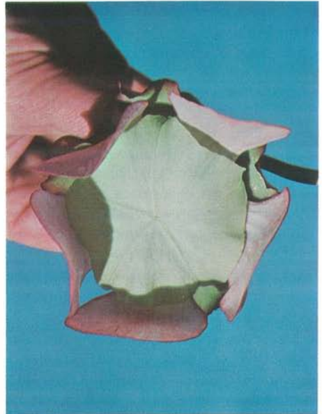
Fig. 4. ssp. venosa "Louis Burk" flower showing very pale to nearly white "umbrella."