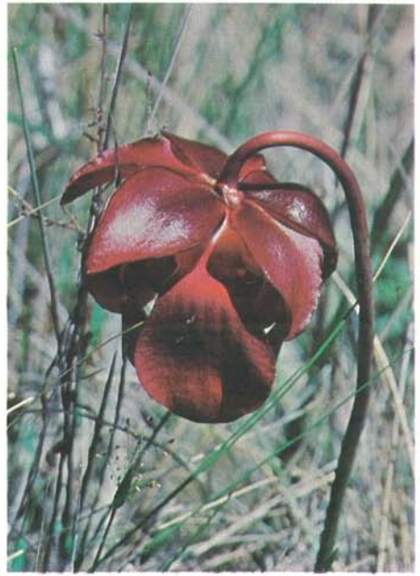
Fig. 2. Flower of ssp. venosa .