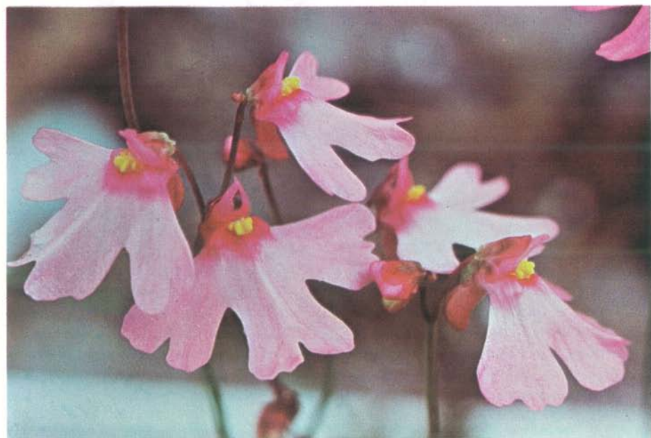
Close up of cluster of flowers.