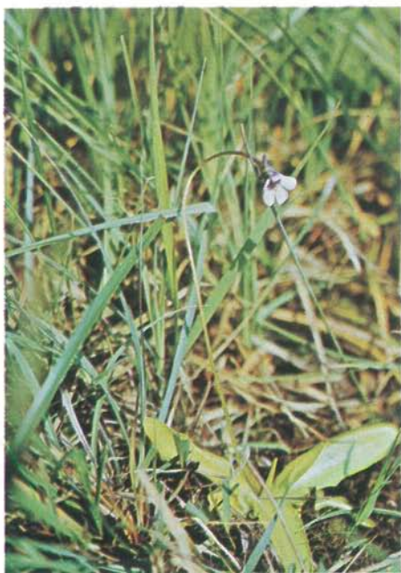
Plate 2. P. bohemica in habitat in northern Czechoslovakia.