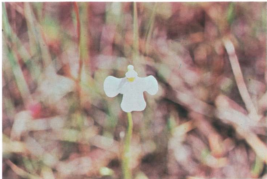
White form of Polypompholyx multifida .