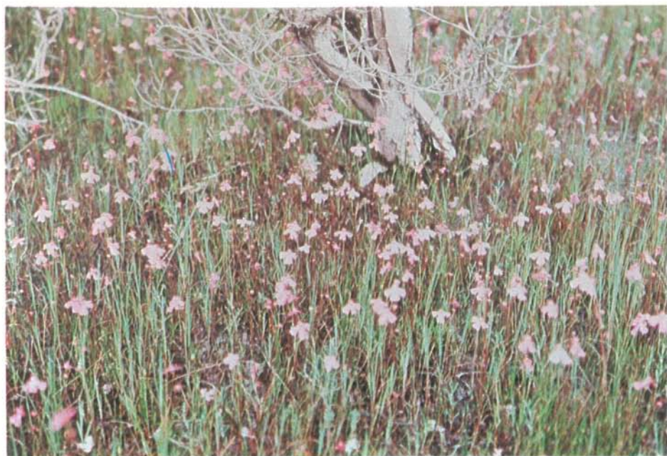
Polypompholyx multifida in habitat.