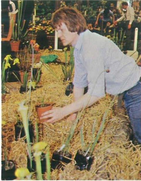
PREPARATION OF STAND BY MEMBERS OF BRITISH CP SOCIETY