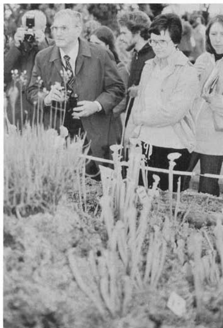
Public reaction to CP exhibit at Chelsea Flower Show

Once again the society were awarded for their efforts by the Royal Horticultural Society, and a silver-gilt Lindley medal became yet another possession.