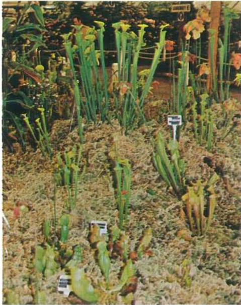
THE FINISHED STAND WHICH WON THE LINDLEY MEDAL