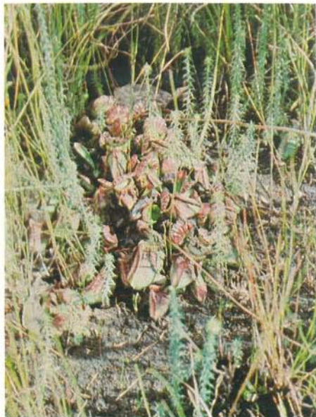
Cephalotus follicularis