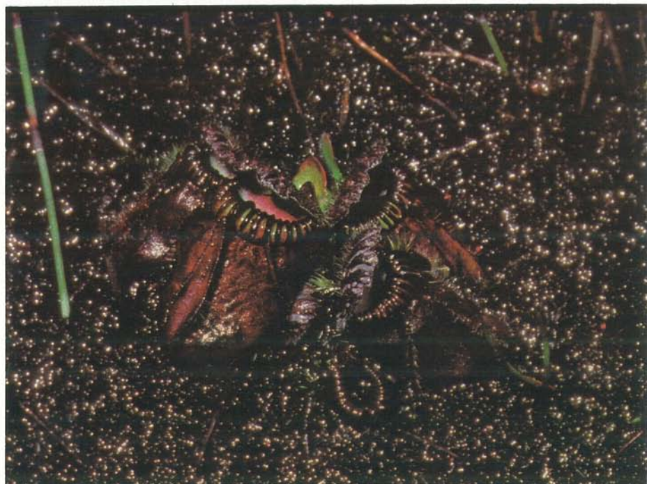
Cephalotus : Two People Bay