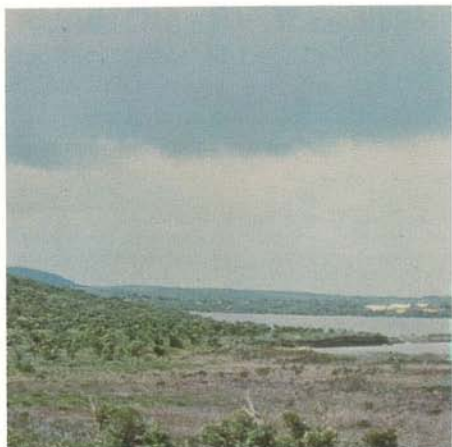
Two People Bay