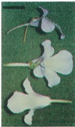
9. P. longifolia ssp. caussensis