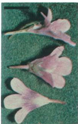
14. P. macroceras (USA)