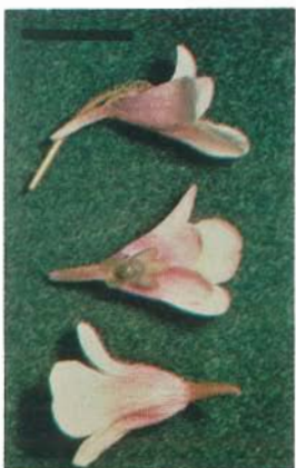
16. P. nevadensis