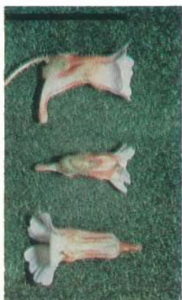
25. P. lusitanica