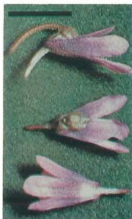
20. P. vulgaris (USA)