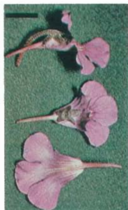
4. P. grandiflora