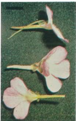
17. P. vallisneriifolia