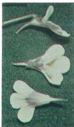
3. P. corsica