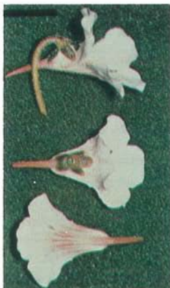
6. P. grandifl. ssp. rosea