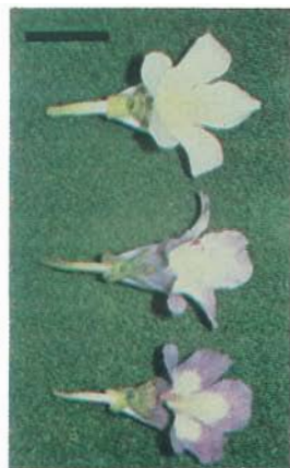
12. P. longifolia ssp. reichenbachiana