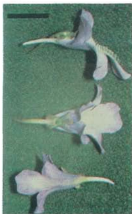
11. P. longifolia ssp. reichenbachiana