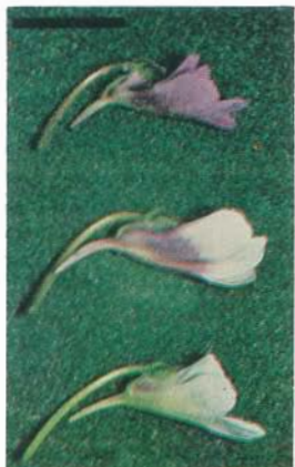
18. P. vulgar/f. bicolor , f. albida