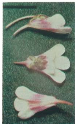
21. P. vulgaris f. bicolor