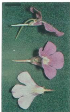
10. P. longifolia ssp. longifolia