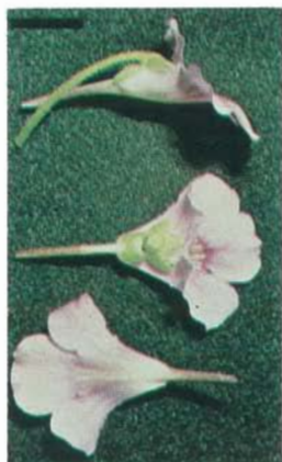
5. P. grandifl. f. pallida