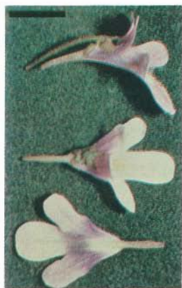
15. P. macroceras ssp. nortensis