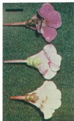
7. P. grandifl./f. pallida/ ssp. rosea