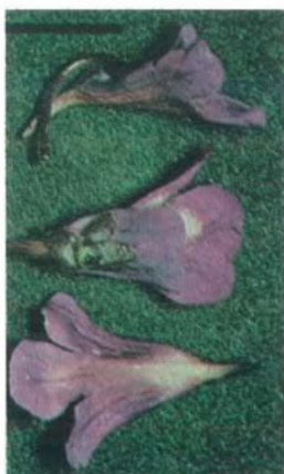
2. P. balcanica