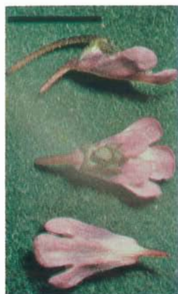
19. P. vulgaris (Europe)