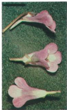
8. P. leptoceras