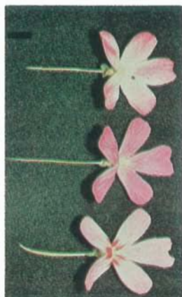
27. P. moranensis (color variation)