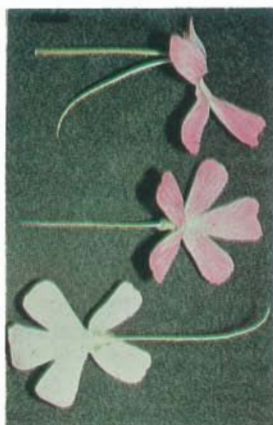
26. P. moranensis