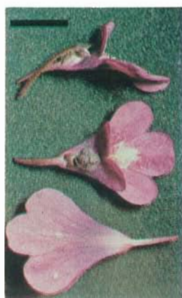
22. P. leptoceras x vulgaris