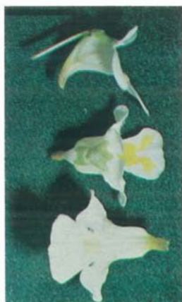
1. P. alpina