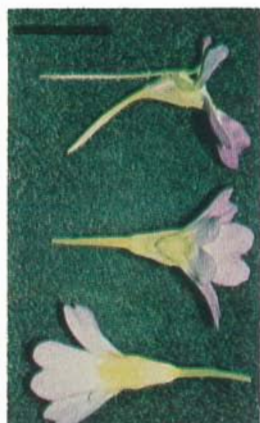
24. P. hirtiflora