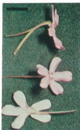
23. P. gypsicola