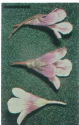
13. P. macroceras (Japan)