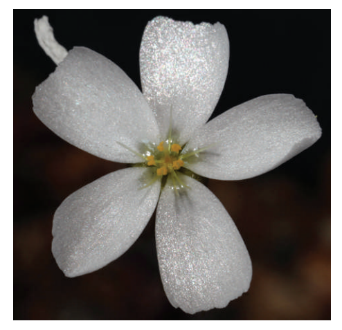
Figure 2: Drosera radicans is one of the few tuberous sundew found to have unscented flowers in this study.