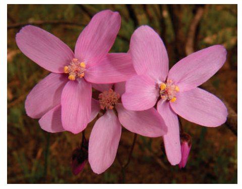
Figure 4: Drosera marchantii subsp. marchantii plants flower in abundance after fire and have large and abundant flowers with a strong fruity sweet scent.