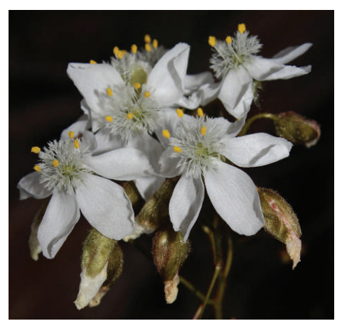
Figure 1: Drosera macrantha subsp. macrantha "silky sepal form" showing the distinctive hairs on the inflorescence. This sundew, from the Wongan Hills, has sugary sweet scented flowers and thus differs from all other forms of this subspecies sampled for this project.

The majority of the rosetted tuberous sundews sampled had nectar sweet floral fragrance of moderate strength. The exceptions were the fruity sweet scents of flowers of both subspecies of D. macrophylla Lindl.