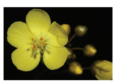
Figure 3: Drosera moorei flowers have a nectar sweet scent and wonderful bright yellow color.