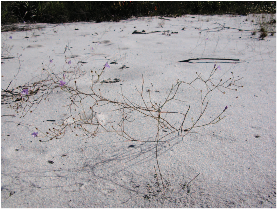
Figure 3: Philcoxia minensis in habitat in the Serra do Cabral, Minas Gerais state, Brazil. The plant grows in open plains of very dry, pure, fine quartzitic sand, accompanied only by a few cacti and annual Eriocaulaceae (in the background in the upper right).

order of dicotyledonous flowering plants, the Lamiales (the mint-allies), in only distantly related groups: namely in Philcoxia from the Plantaginaceae, in the carnivorous Lentibulariaceae ( i.e. Pinguicula , Utricularia , and Genlisea ), and in the even more distantly related Byblis from the Byblidaceae.