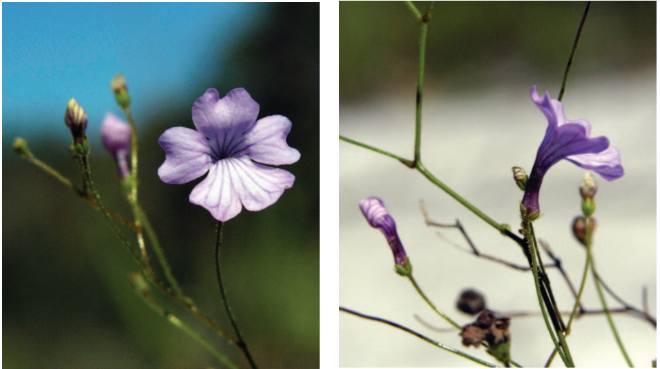
Figure 2: Close-up of the purple flowers of Philcoxia minensis , which are about 5 mm in diameter.

nematodes, but associated bacteria, this does not mean that the carnivorous nature of Philcoxia has to be questioned: Ellis & Midgley (1996) demonstrated the digestive mutualism of the enzyme-lacking carnivorous plant Roridula in the very same way, by applying nitrogen-traced Drosophila flies to Roridula leaves. After a few days, an impressive amount of the nitrogen isotopes was already found incorporated into the Roridula leaves, after it has been sucked from the flies by the associated Pameridea bugs, which then deposited their heavy nitrogen enriched faeces on the plant leaves, where it was absorbed from specialized cells. If you will place isotope-traced insects on non-carnivorous sticky plants like Proboscidea , Ibicella , or tomatoes, however, barely any nutrients from that prey will be found in the plants. That makes the difference between a carnivorous plant like Philcoxia , and a non-carnivorous plant like Proboscidea .