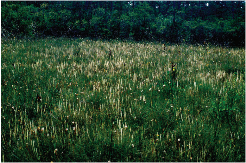
Figure 6: A familiar view of Drosera tracyi , backlit in the evening sunset (Liberty County, Florida).

different species concepts may come to different conclusions, and I do not fool myself into thinking I have had the last word on the subject of the two thread-leaf sundews. As Peter Taylor (1989) wrote, “Nothing is perfect, except perhaps the plants that we study and attempt to understand....”