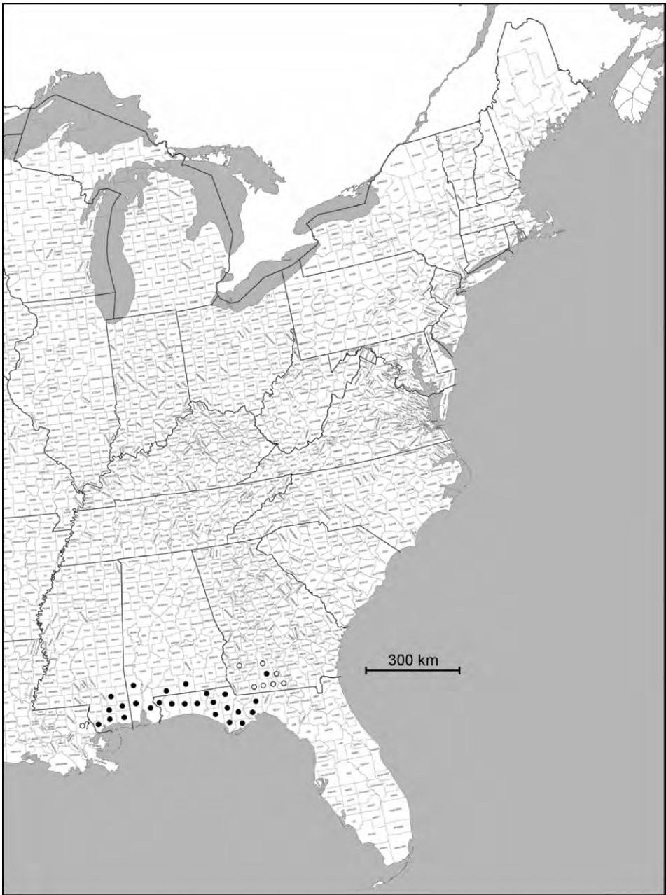
Figure 1: A 2010 snapshot of the range of Drosera tracyi . Counties or parishes believed to currently maintain native populations are indicated by a black dot. Counties where it is believed D. tracyi has been extirpated are indicated by an empty circle. The question mark for the Louisiana site notes that it has not been confirmed that Drosera tracyi has ever occurred there.