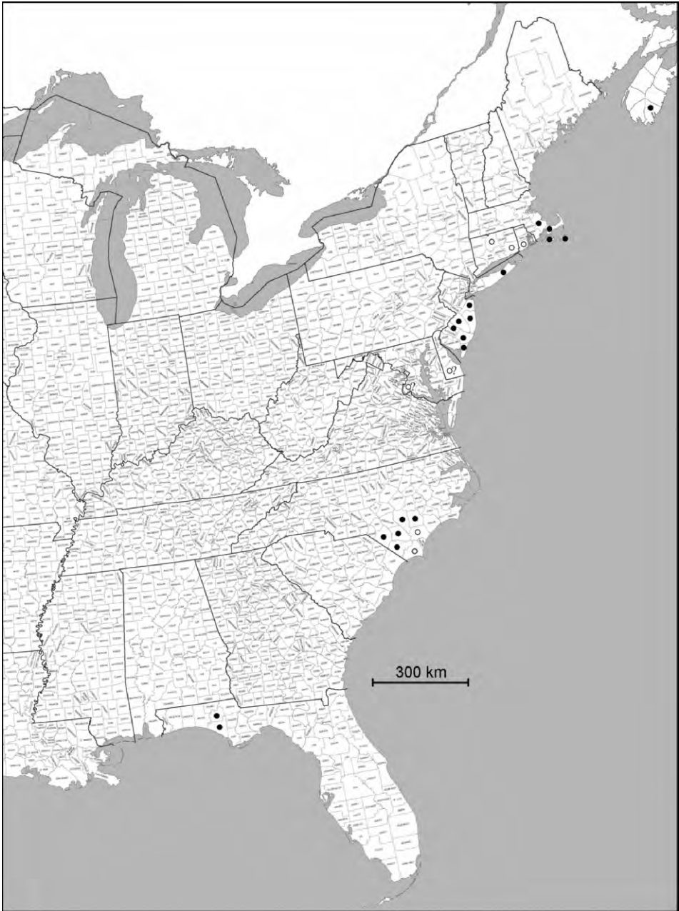
Figure 2: A 2010 snapshot of the range of Drosera filiformis . Counties believed to currently maintain native populations are indicated by a black dot. Counties where it is believed D. filiformis has been extirpated are indicated by an empty circle. Only native sites have been plotted. The question marks for the Delaware and Maryland sites note that it has not been confirmed that Drosera filiformis has ever occurred as a native at these locations.