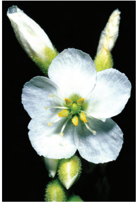
Figure 5: The white-flowering, mutant form of Drosera tracyi .

species when you consider the total ranges shown in Table 2—for example the number of flowers per inflorescence can range from 4 to 21 for D. filiformis and 12 to 20 for D. tracyi . The overlap here is significant, but the one-sigma ranges in Table 3 do differ much more clearly, i.e. , 7-15 for D. filiformis and 13-19 for D. tracyi .