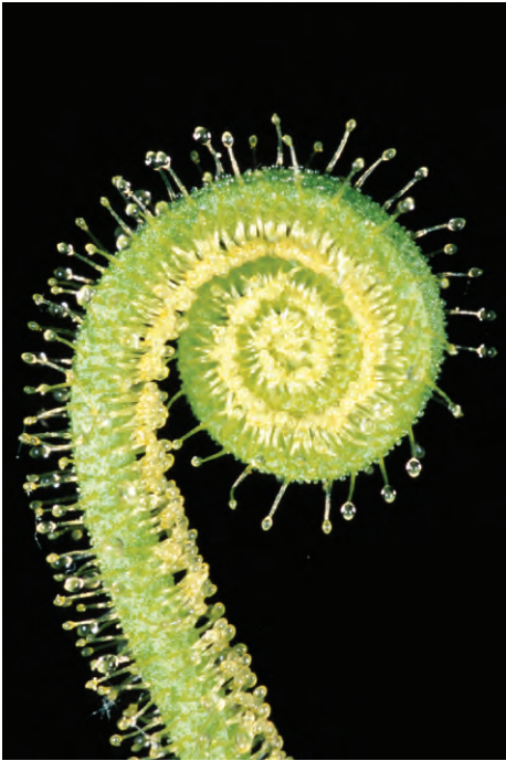
Figure 4: A close view of an unfurling leaf of Drosera tracyi .