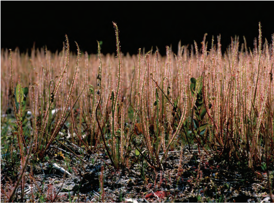
Figure 3: Drosera filiformis growing on sandy flats in New Jersey (Ocean County).