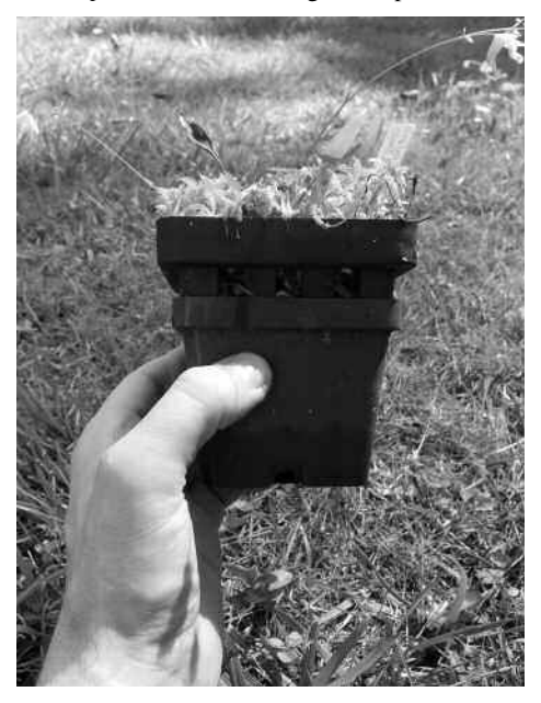
Figure 5: Utricularia asplundii in a nested pot.

If using any of the other potting methods/media the watering method I found that worked well was to use small Styrofoam blocks (2-3cm tall) under the pots. By setting the pot on blocks the excess water drains away so that the pot is not sitting in it but its presence in the tray creates a higher local