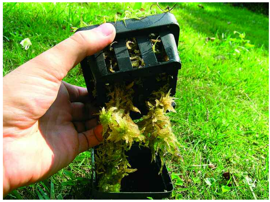
Figure 3: Utricularia asplundii, showing the coarse planting medium.