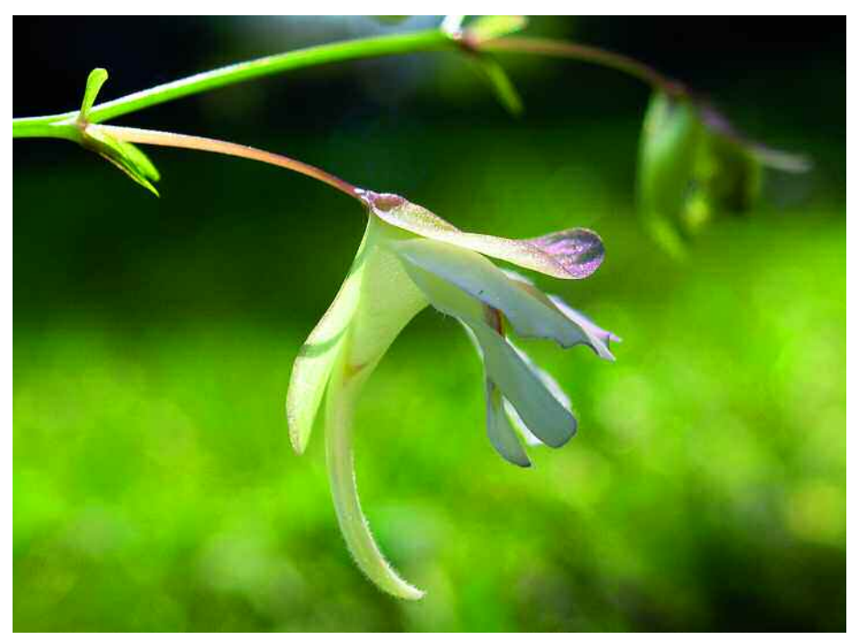
Figure 1: Utricularia asplundii.