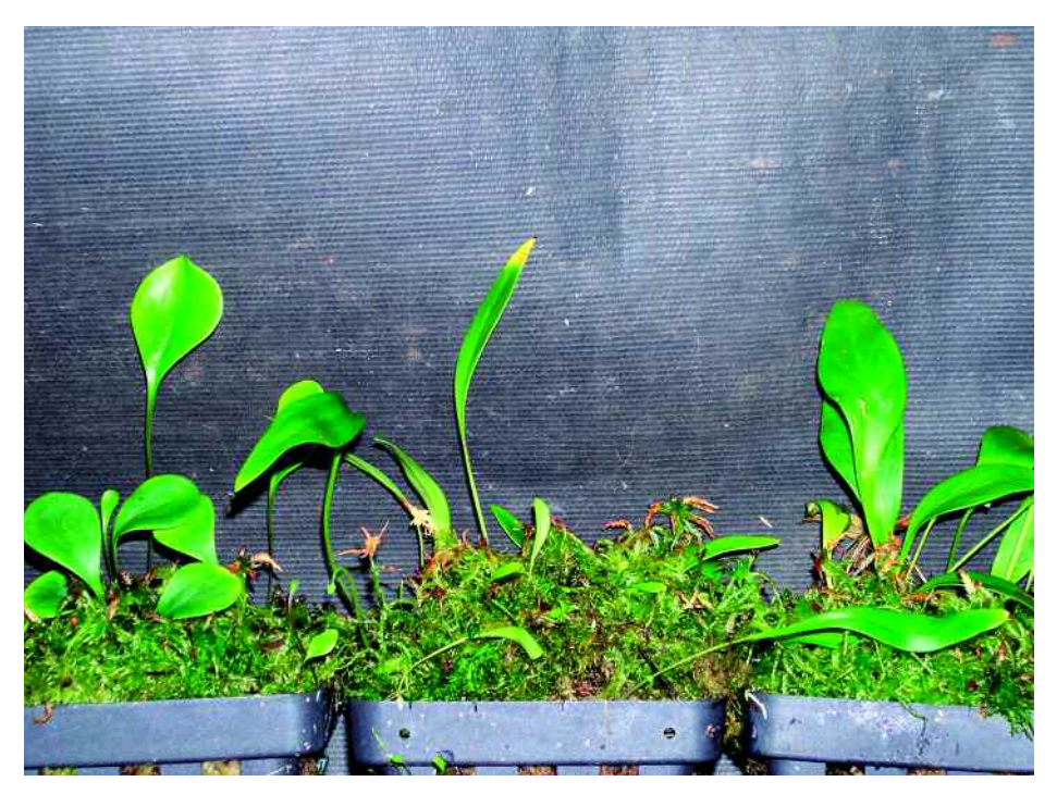
Figure 4: Left to right, Utricularia quelchii, U. 'Jitka', and U. praetermissa in cultivation.