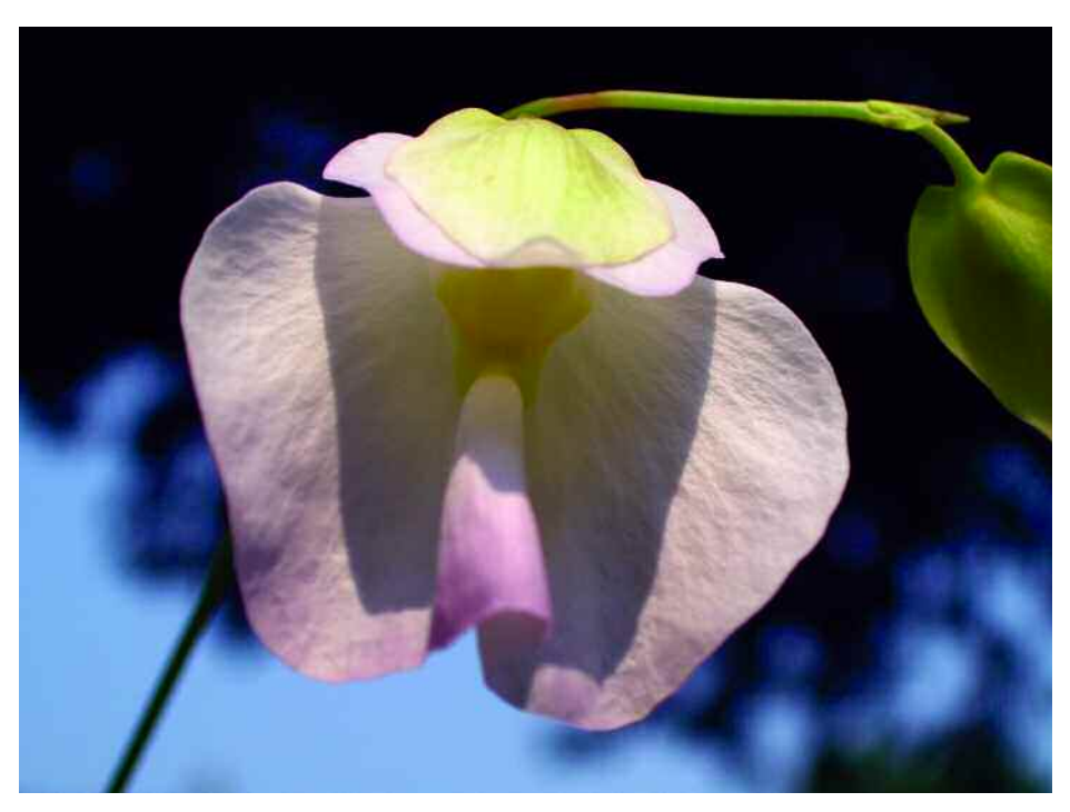
Figure 2: Utricularia praetermissa.